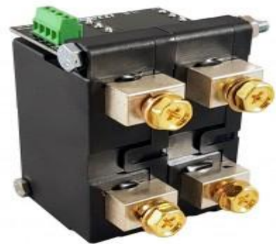
123Electric Smart Relay