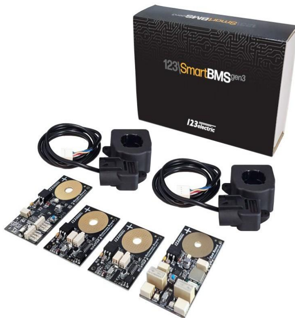
123Electric BMS GEN V3

Professional, easy to use solutions for off and on grid energy storage