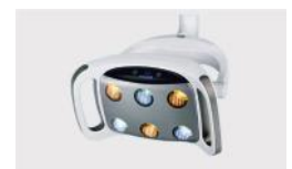
Sensor Based Led Light With Digital Display