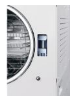
Double Door Lock Protection