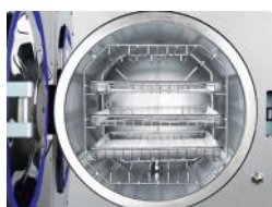
Six Layer Pot Body Structure