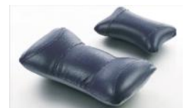
Extra cushions for more comfort