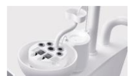
State-of-the-art disinfection system