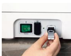
USB Record Read