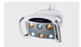
Sensor Based Led Light With Digital Display