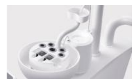
State-of-the-art disinfection system

Multiple color choices of leather cushion