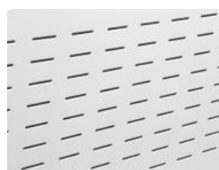
Heat Dissipation Structure