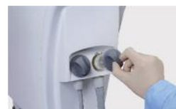
High & low suction filtration system