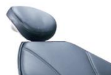
Boutique & fashionable waist headrest