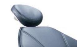
Boutique & fashionable waist headrest