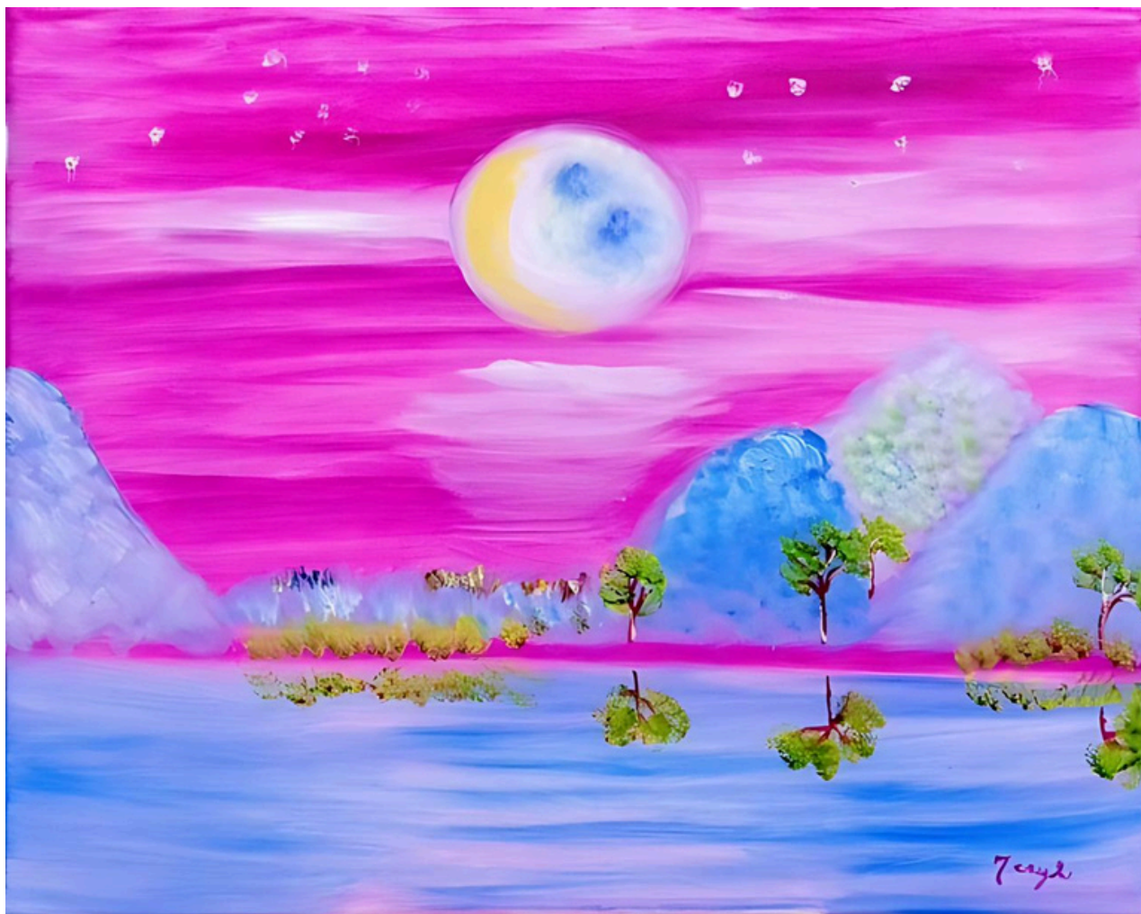
Icy Blue Moonglow