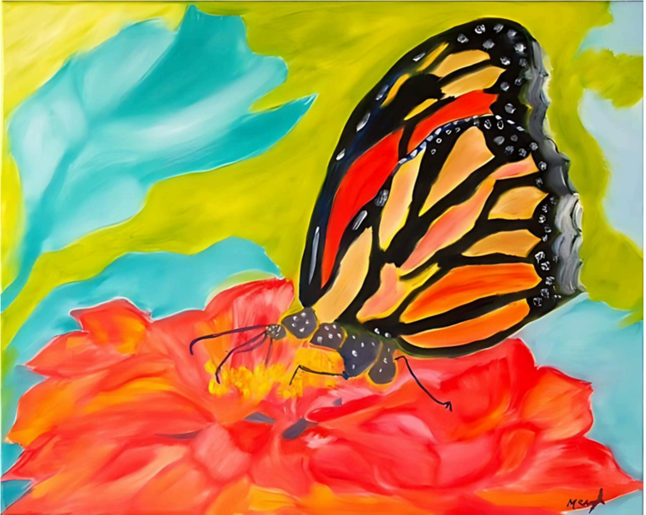
Stained Glass Buttery