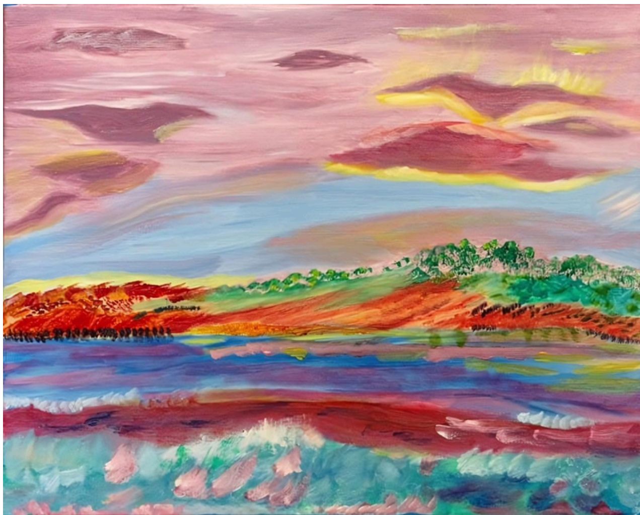
New Year's Monterey