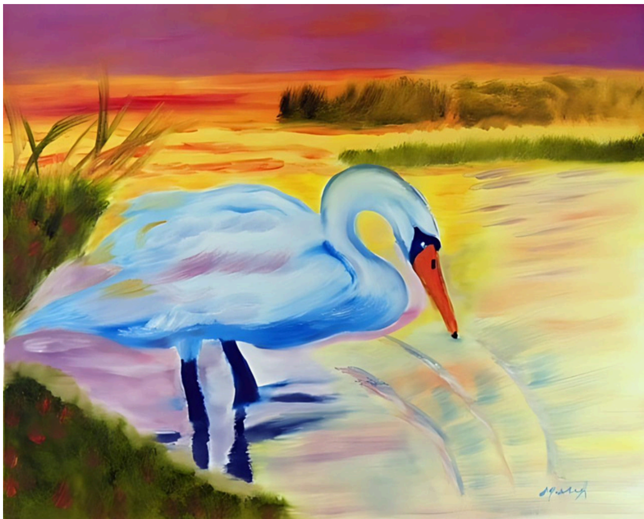
Color My World