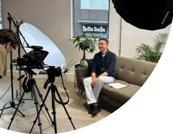
Filming the course sessions at Telford Minster