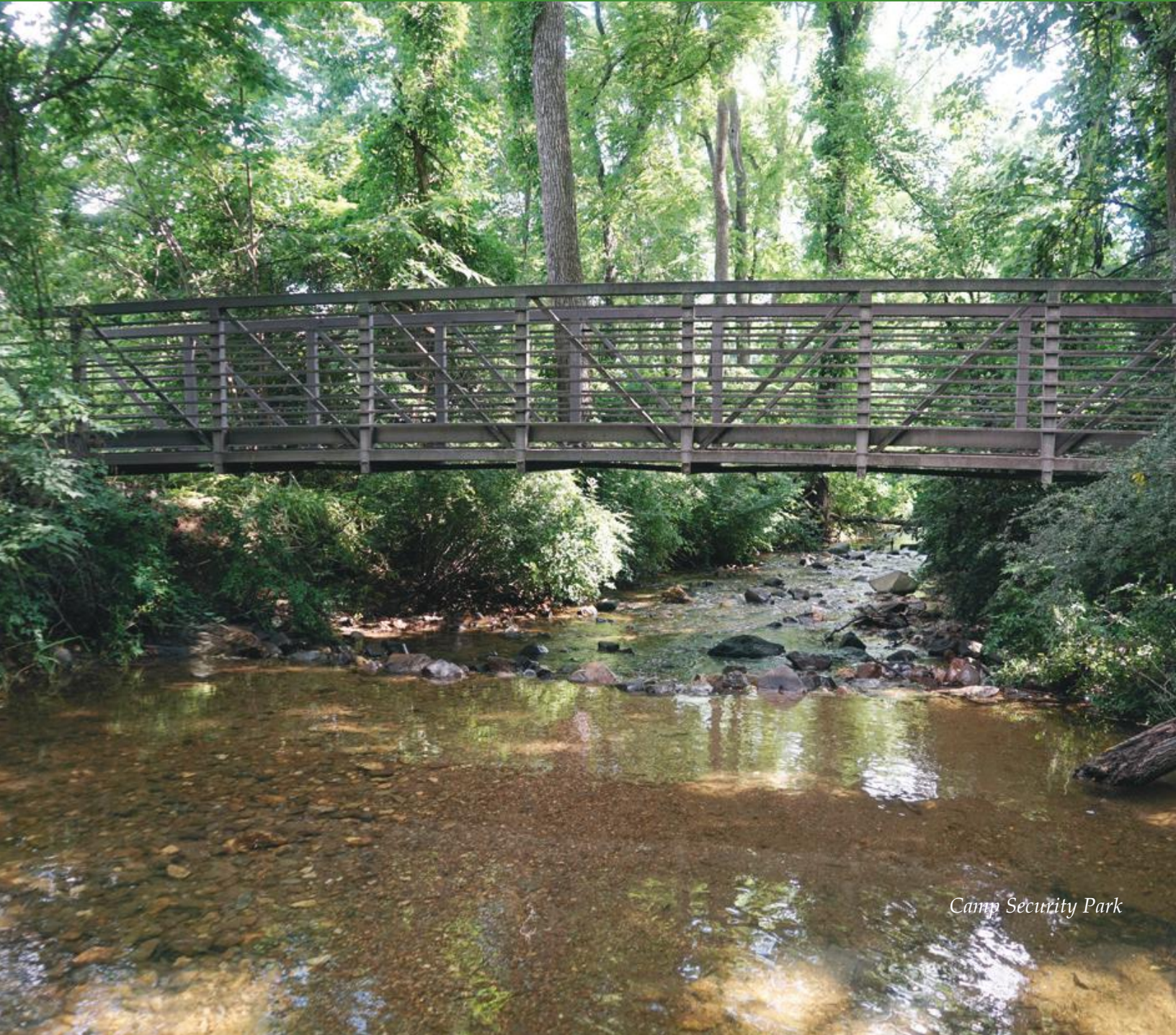
Camp Security Park