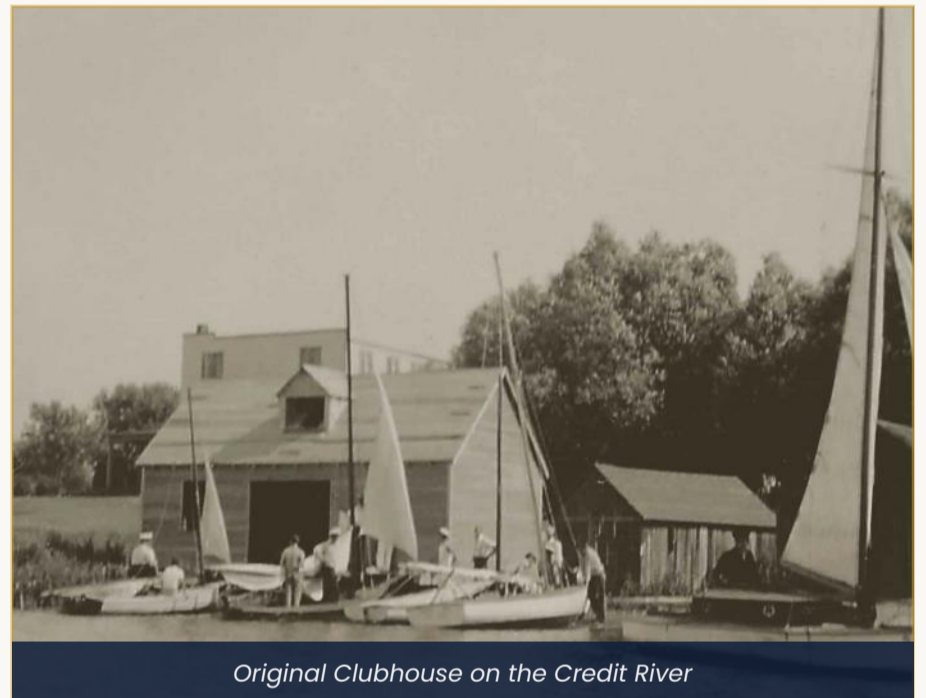
Original Clubhouse on the Credit River