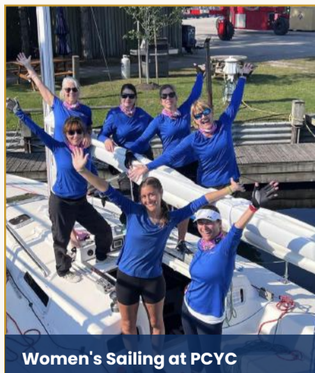
Women's Sailing at PCYC