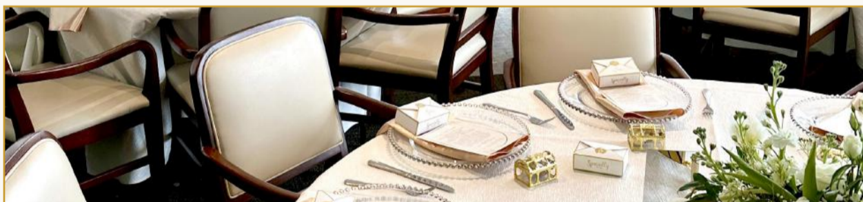
Private Events and Member Gatherings