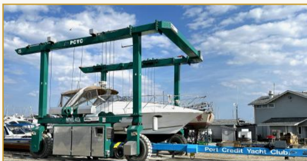
Marine Lift and Harbour Access