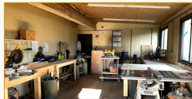
Workshop and Practical Support

"PCYC is about more than boating. It's about community. Through cruising, social events, and shared traditions, the club makes it easy to feel connected and welcomed."