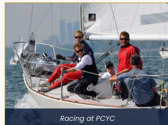
Racing at PCYC