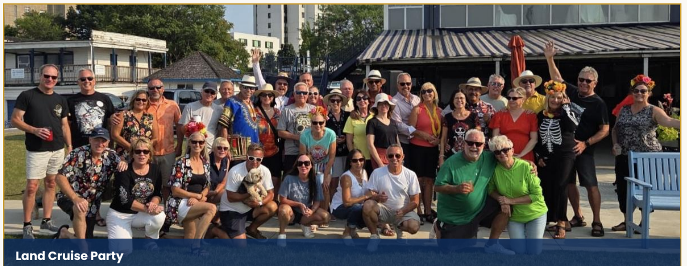
Land Cruise Party

"Joining a PCYC cruise instantly made us feel at home. The shared experiences turned boating into lasting friendships. It's truly about community."