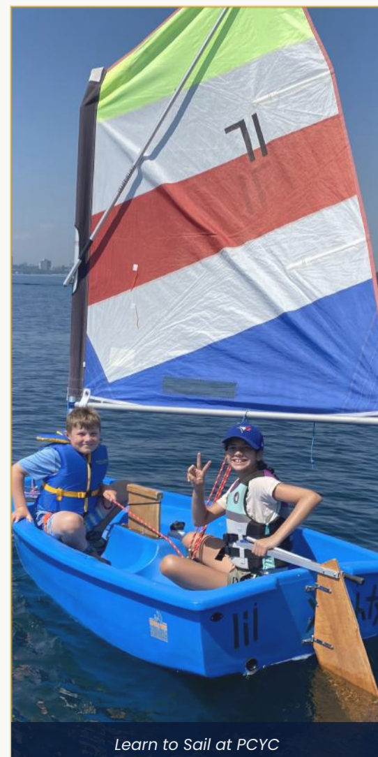
Learn to Sail at PCYC