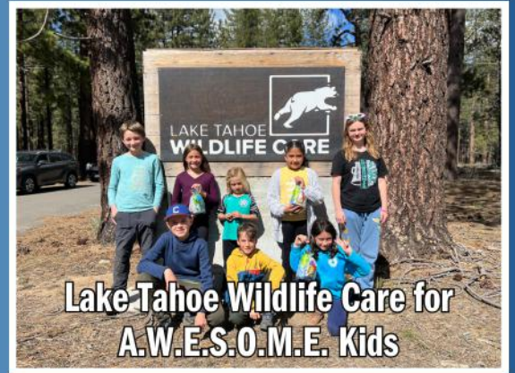
Lake Tahoe Wildlife Care for A.W.E.S.O.M.E. Kids