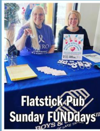
Flatstick Pub Sunday FUNddays