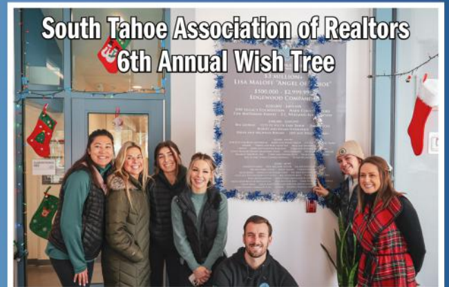
South Tahoe Association of Realtors 6th Annual Wish Tree