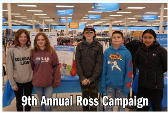
9th Annual Ross Campaign