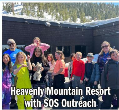
Heavenly Mountain Resort with SOS Outreach