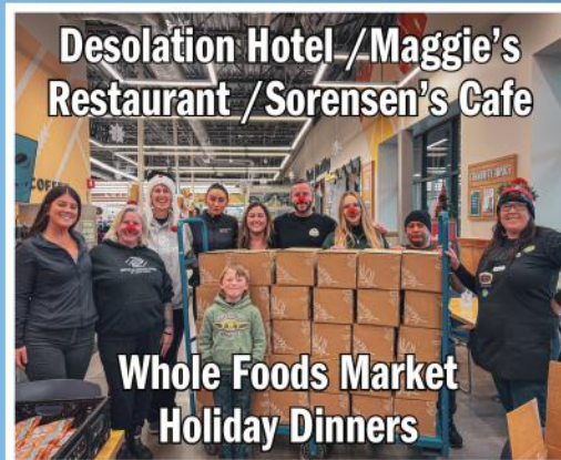
Desolation Hotel / Maggie's Restaurant / Sorensen's Cafe