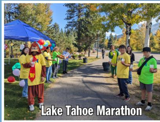
Lake Tahoe Marathon