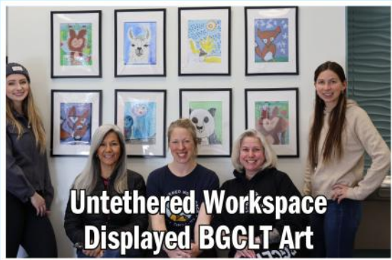
Untethered Workspace Displayed BGCLT Art