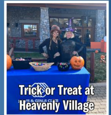
Trick or Treat at Heavenly Village