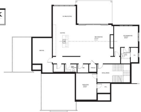
BASEMENT FLOOR PLAN

www.loudermilkhomes.com | office: 770.485.2600 | email: info@loudermilkhomes.com 1827 Powers Ferry Road, Building 6, Atlanta, GA 30339 Architecture and landscape renderings do not reflect finished selections.