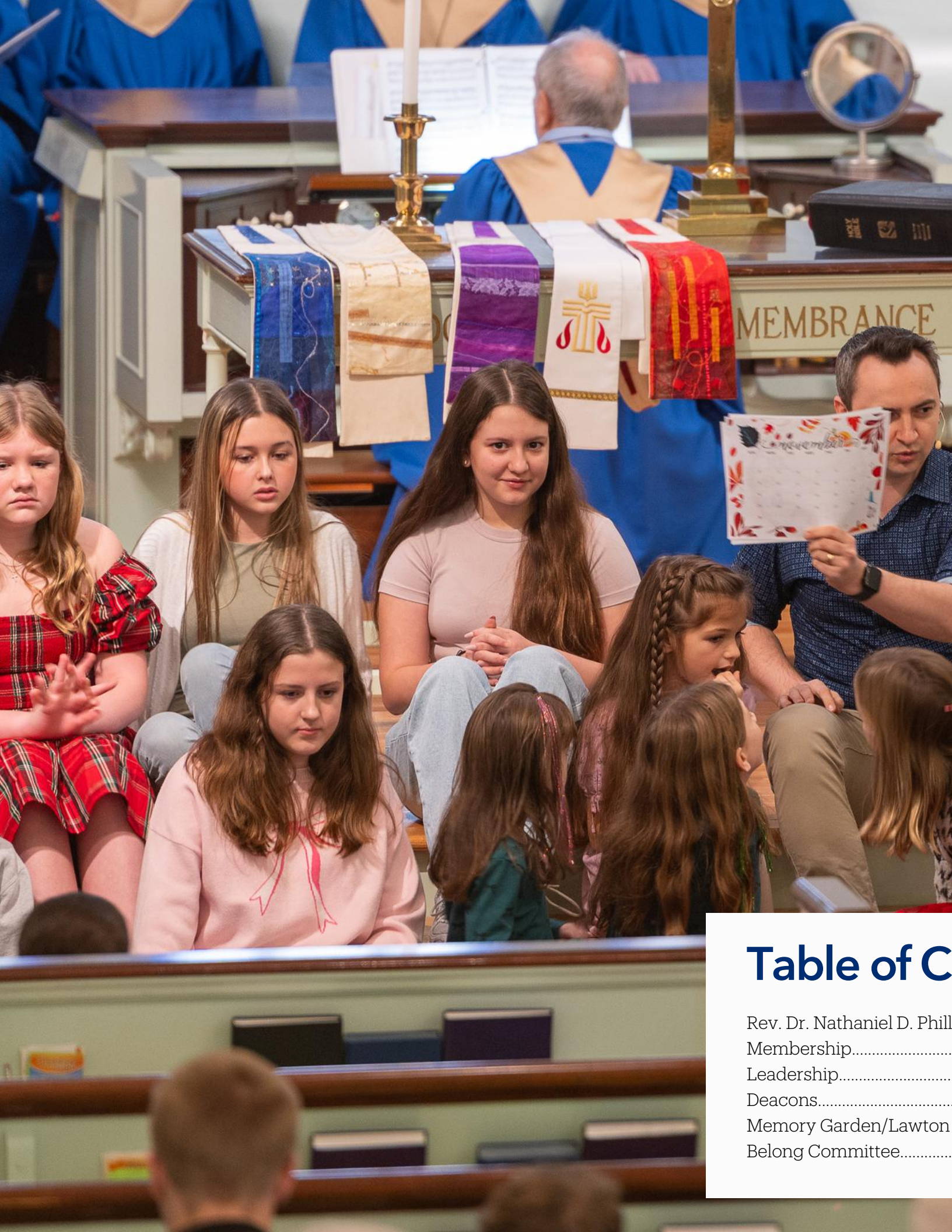
Table of C