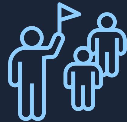
Port Tours Job Shadowing

Only available after completion of corresponding unit.