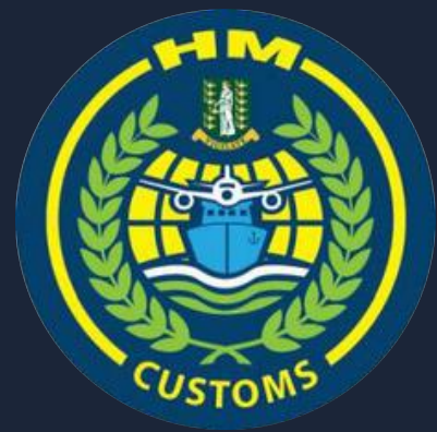
Her Majesty's Customs