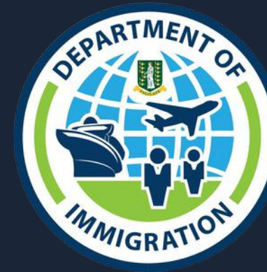
Department of Immigration