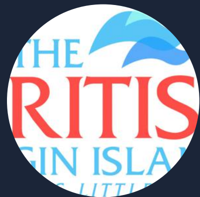
BVI Tourist Board