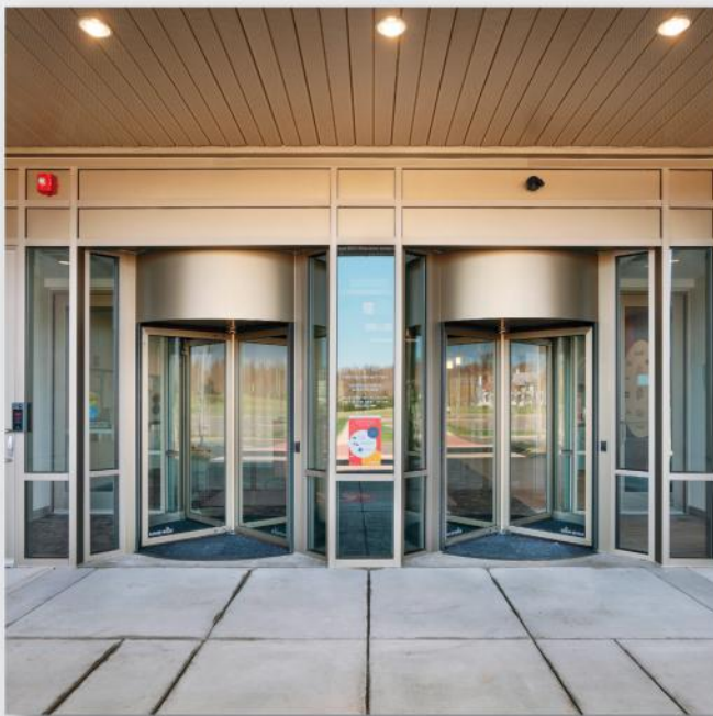
Secure Revolving Door

This Fortune 500 corporation required complete building security upgrades at its facilities. The goal of this project was to eliminate unauthorized access to the building by providing single person entry into distinct entrances. Berkowsky and Associates provided both design and construction services, taking on single-source responsibility for this important project.