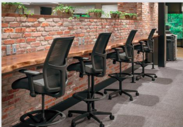
Touchdown Work Areas