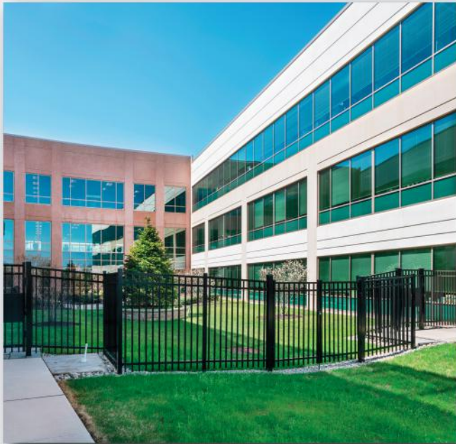
Exterior Security Gate

At each location, new entrances with automatic revolving doors, interior doors, turnstiles, security cameras, card keys, digital recorders and intercom communications were installed and upgraded. The project also included site security and turnstiles as well as utility service entrance locations.