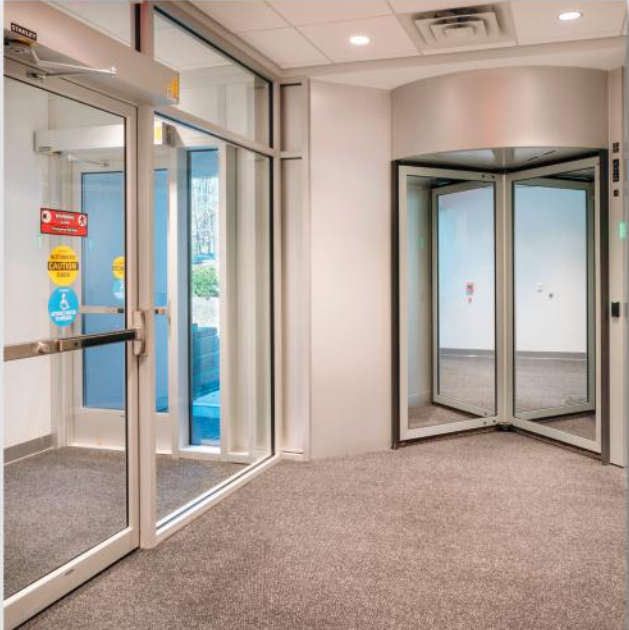
Secure Revolving Door