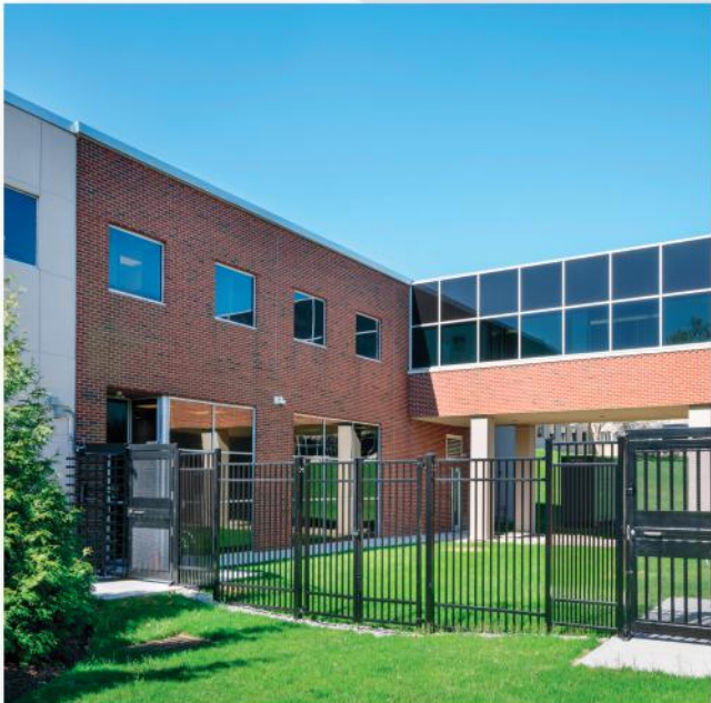
Exterior Security Gate