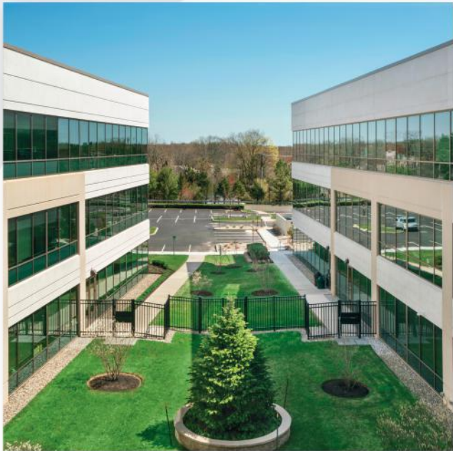
Connecting Exterior Security Gates