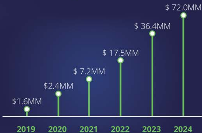
Chart not to scale. Numbers are rounded to the nearest hundred thousandth.