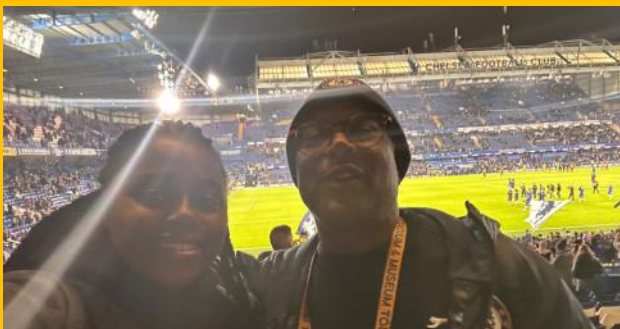
We enjoyed the Wolves game