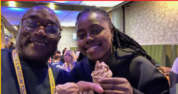
Fab buffet complete with ice cream

Tropical Creole curry goat dinners are getting gobbled up. My ambition is a stall or truck at a big festival. Surely jerk chicken and dumplings give a better high than all the gear at Glastonbury? Mine's the best joint around!