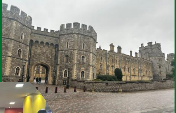
Windsor Castle tours are chaotic; too many drama queens