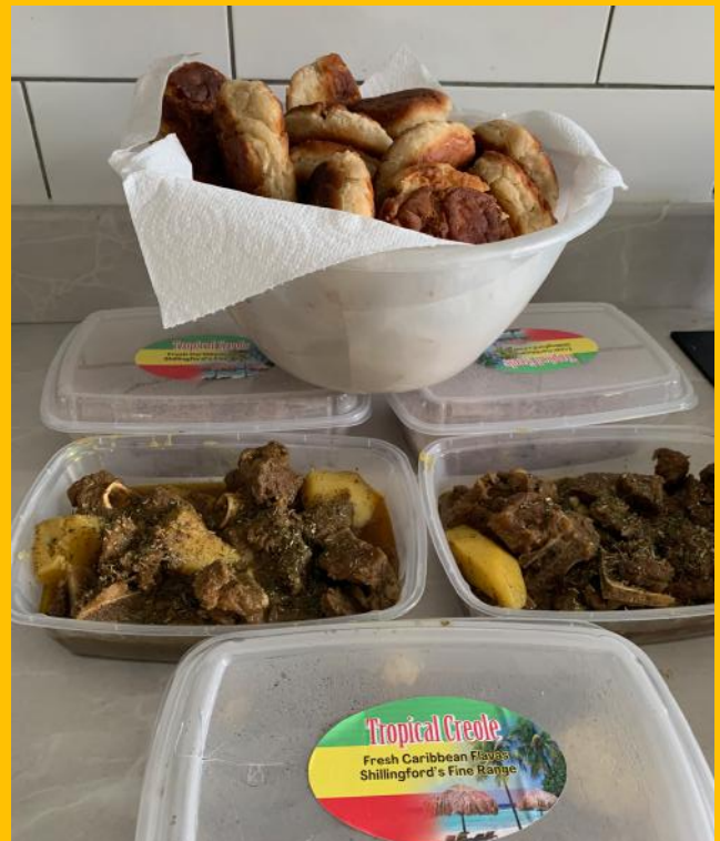
My Tropical Creole cuisine is enjoyed by all

Tropical Creole curry goat dinners are getting gobbled up. My ambition is a stall or truck at a big festival. Surely jerk chicken and dumplings give a better high than all the gear at Glastonbury? Mine's the best joint around!