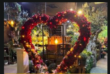
Valentine's Day is approaching