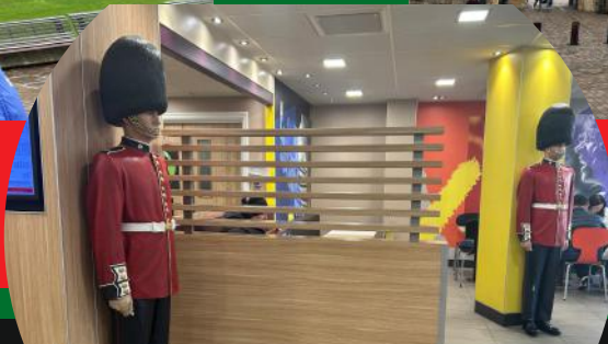
Security at Windsor's Maccy D's is strict but wooden