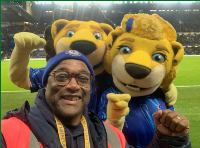
Bridget and Stamford are Chelsea superheroes

Chelsea's roller-coaster season continues. Started well, but a miserable festive season and start of the year. I'll send them some of my salt-fish fritters.