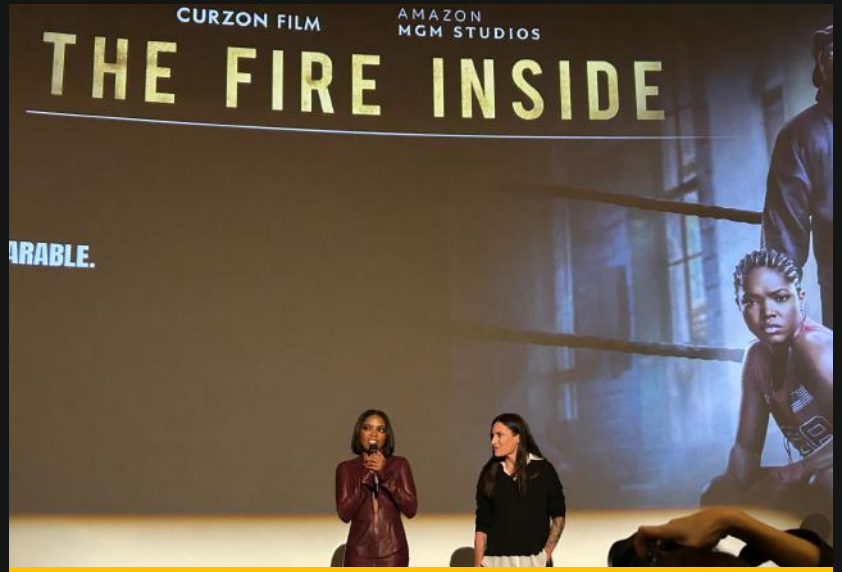
The Fire Inside is on general release soon