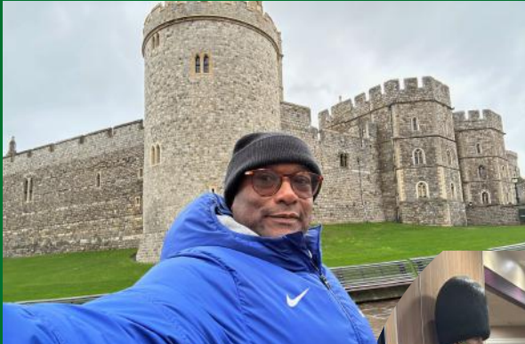
Ready for tea and chat with King Charles

Took a trip to Windsor. Sleepy, quaint town beside the castle. Didn't take the castle tour – TripAdvisor reviews put me off. But did pop in for a quick cuppa with Charlie. Nice chap. Proof? He wanted a selfie but I gave him a right royal snub. Train to catch!