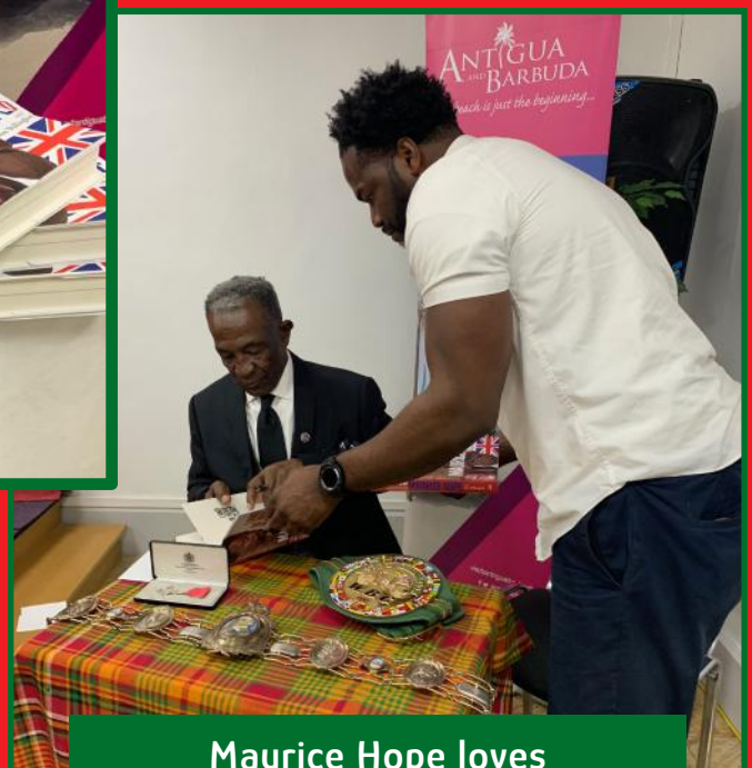
Maurice Hope loves interacting with fans