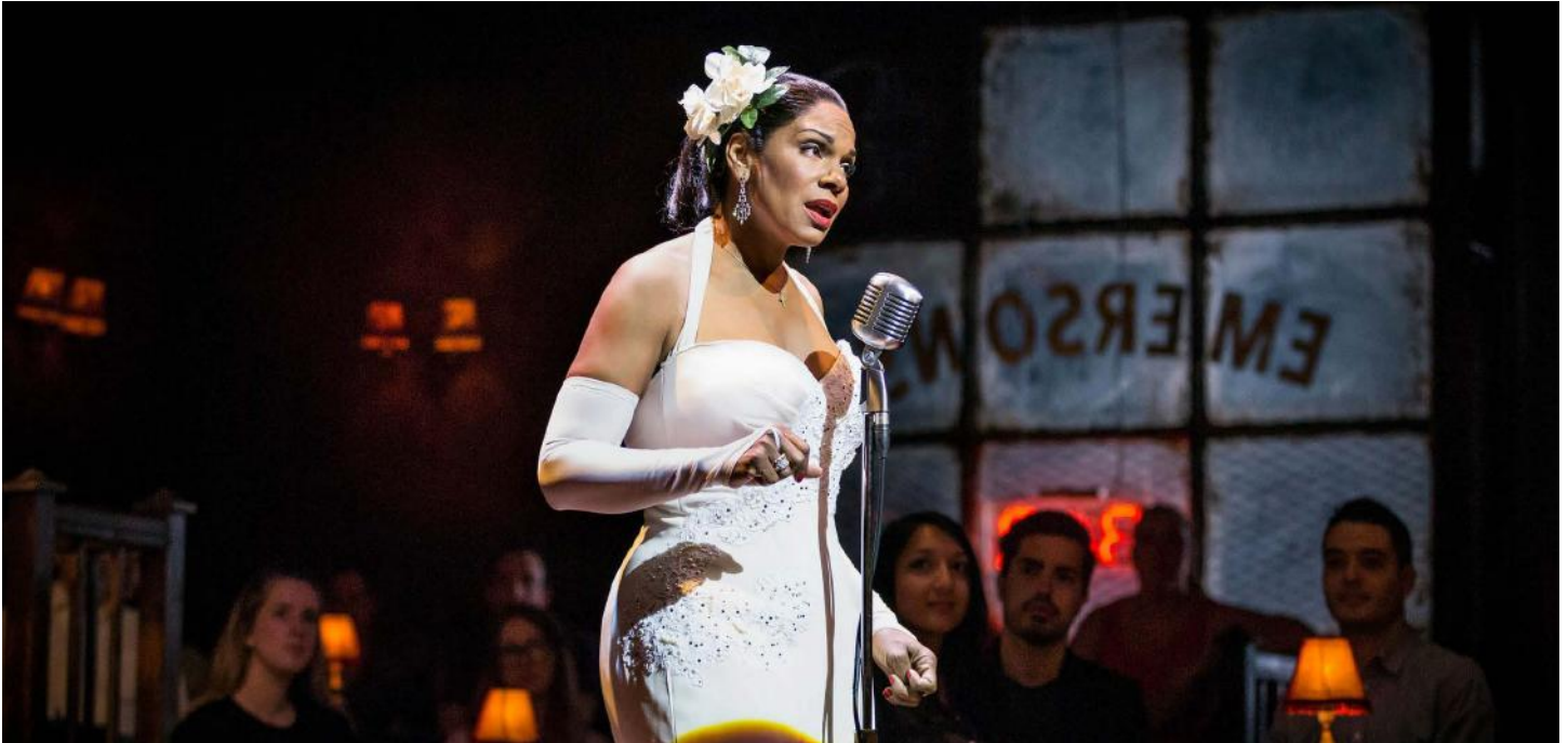
Audra McDonald in Lady Day at Emerson's Bar and Grill on Broadway