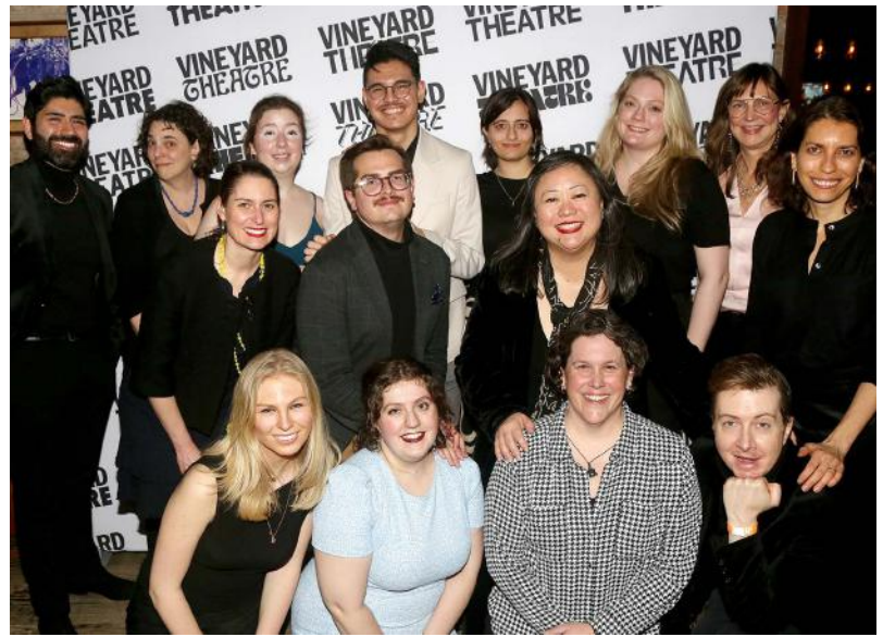
Vineyard Theatre staff at opening night of Russian Troll Farm