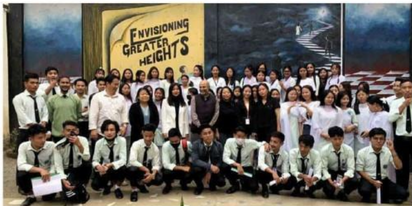
Students and officials during the UNNATI UNXT valedictory session in Dimapur Government College on March 25.

The Government of Nagaland had signed MoU with UNNATI- an NGO based in