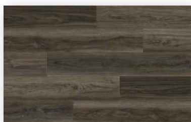
WOODCLIFF LAKE AW 102103