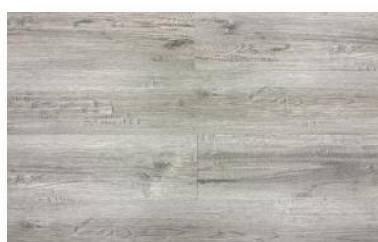
SMOKY DOVE LUX 551003