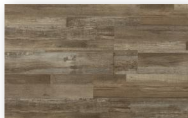
ROAST TAUPE AW 116801