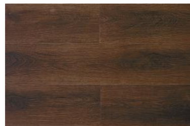
NARINO MOCHA LUX 551002