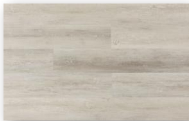
PALMIILA SAND ADV 501001