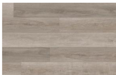
ECRU GREY LUX 552001