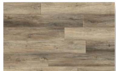
OAK HILL ADV 501004