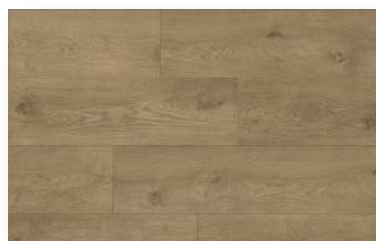
SANDSTONE OAK LUX 552004