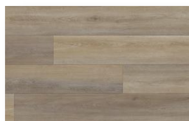
ACADIA SAND LUX 551004