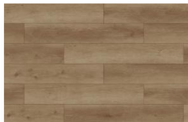
BRUNT SIENNA LUX 552002