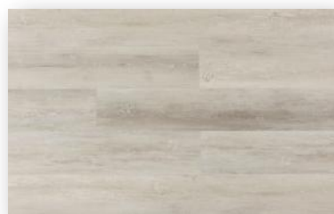
PALMIILA SAND AW 102306