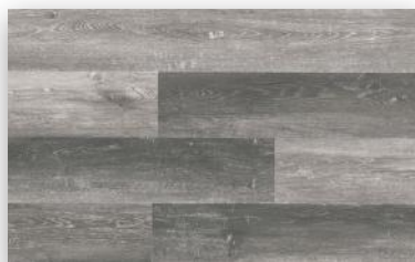
TWILIGHT GRAY AW 111704