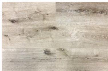
HICKORY BEIGE LUX 551001