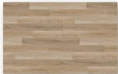
TOASTED PINE ADV 501003