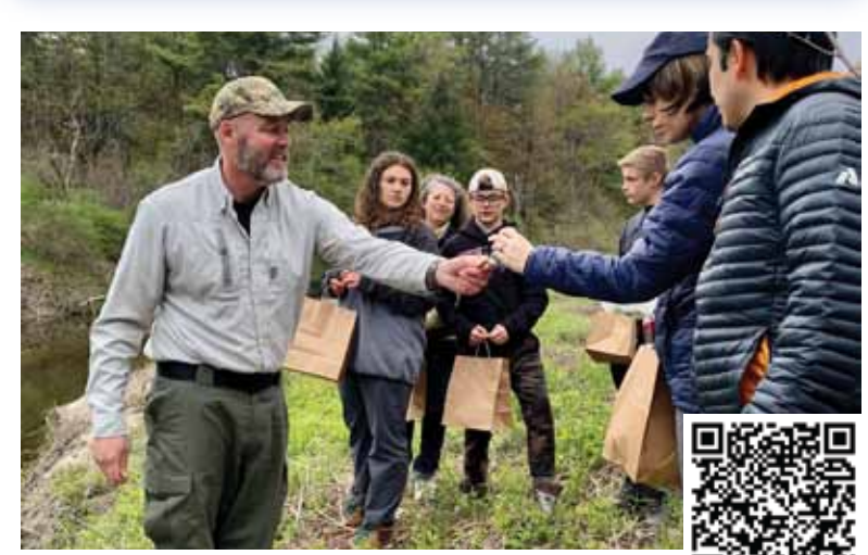
Pre-register for teen & adult activities here:

See our schedule & open gym activity details here: