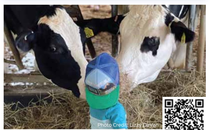
Pre-register for family programs here:

During this multi-visit program, designed for ages 2-5 with their adult caregiver, kids will have the opportunity to build relationships while exploring the environments of Pineland Farms. Age appropriate games and activities will engage participants and inspire their natural curiosity in the world around them.