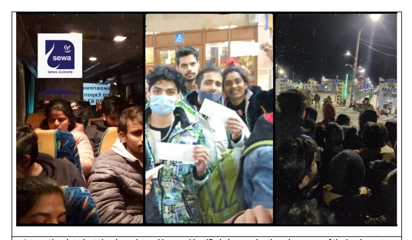
International students in a bus, pictured in an unidentified place, and gathered near one of the border posts

As per reports, about 9,400 students from India are in Ukraine and seeking help to leave the country. According to the United Nations Refugee Agency, over 660,000 people, mostly women and children, have left Ukraine within five days of the beginning of the war. Students stranded in Ukraine are facing multiple challenges, including threat to their lives, non-cooperation from local officials, not being allowed to cross the Ukrainian border, lack of food, and money.