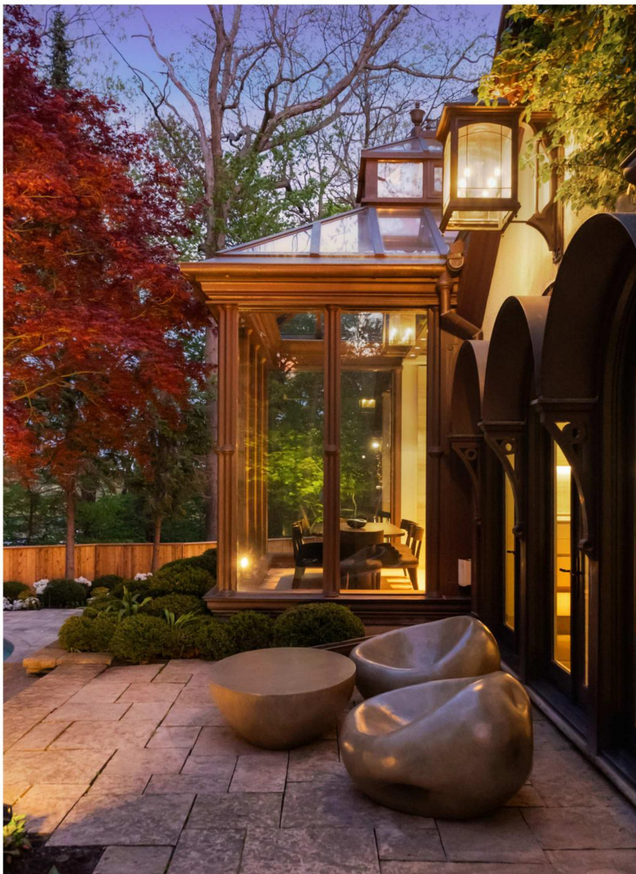
25 NORTH DRIVE