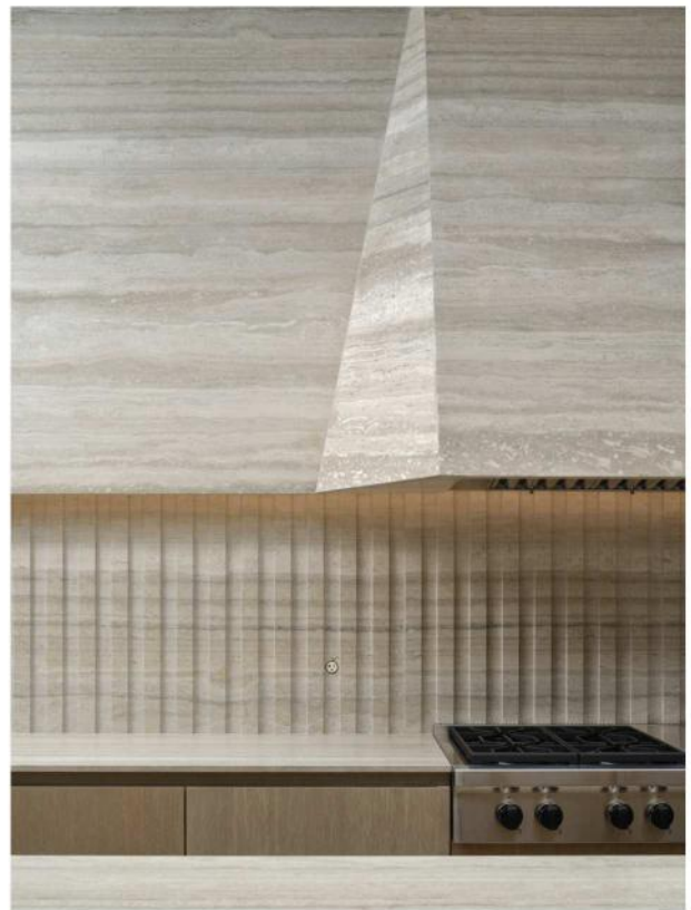
25 NORTH DRIVE