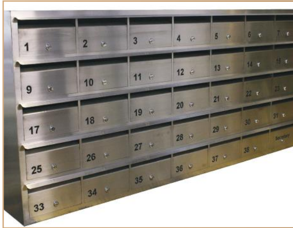
PREMIUM STAINLESS STEEL

Mailmaster is completely conversant with the preference of Australia Post and the Australian Standard (AS NZS 4253-1994). Our standard mailboxes comply with specifications, ensuring that A4 size mail in either landscape or portrait size can be delivered successfully.