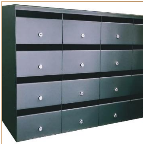
SUPERIOR FLAT PANEL | ALUMINIUM