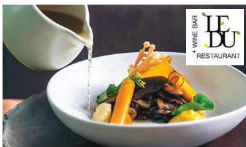
Le Du Michelin-starred restaurant

Enjoy breakfast at the hotel before being picked up for your Oasis Spa experience. Golden Sensation package (3 hrs): Start with a sandalwood body scrub, followed by a Thai massage. Finish with an aromatherapy massage using gold flakes in essential oils, leaving you glowing. After the spa, return to the hotel and relax for the afternoon. In the evening, you'll be picked up for a group dinner at Michelin-starred restaurant Le Du.