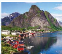
NORWAY AND LAPLAND