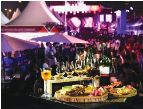
Hong Kong Wine & Dine Festival