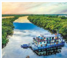
BRAZILLIAN AMAZON ADVENTURE