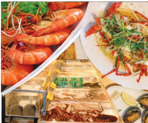
Lei Yue Mun Seafood Market

This evening, you will be transferred to Lei Yue Mun for a special seafood dinner.