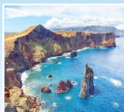
MOROCCO - LAND OF ENCHANTMENT