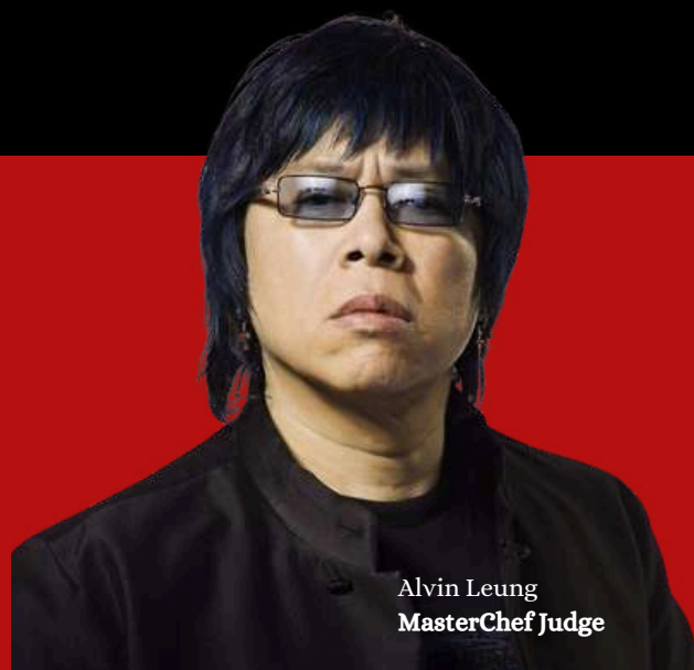
Alvin Leung MasterChef Judge