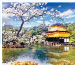
SOUTH KOREA AND JAPAN