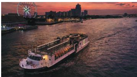
Saffron Dinner Cruise

Transportation: Cathay Pacific or similar