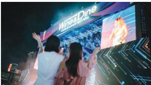
Hong Kong Wine & Dine Festival

Day at leisure, travellers may be out exploring using their city pass. This afternoon, transfer with the group to Central Harbour Event space for Wine & Dine event with VIP entrance. After the festival, travellers are free to go explore the city or go back to the hotel on their own