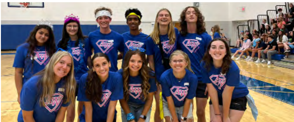
Anthony Wayne High School