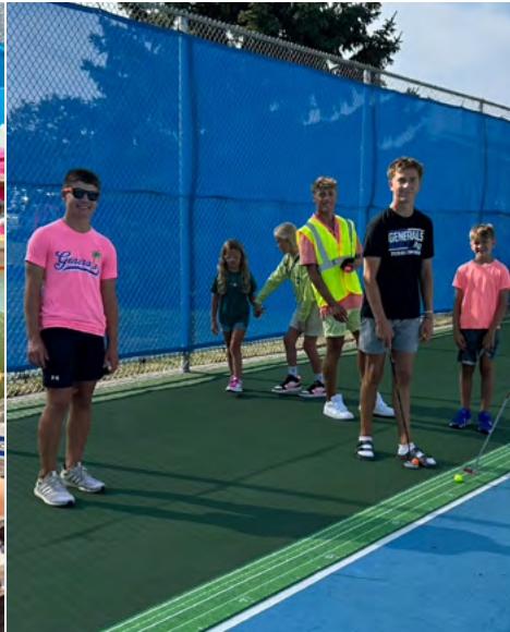
Family Fun Night hosted by the AW Athletic Boosters