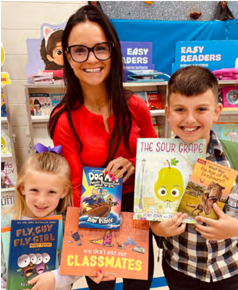
Waterville Primary's Muffins in the Morning and Book Fair