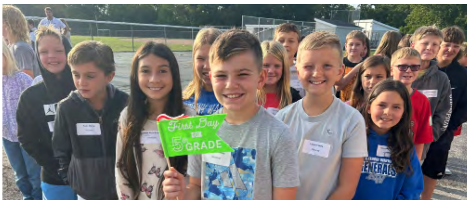
Fallen Timbers Middle School