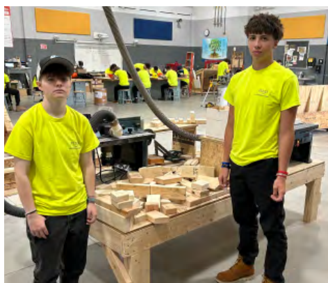
PENTA Career Center