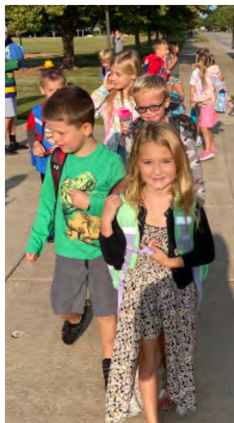
Waterville Primary School