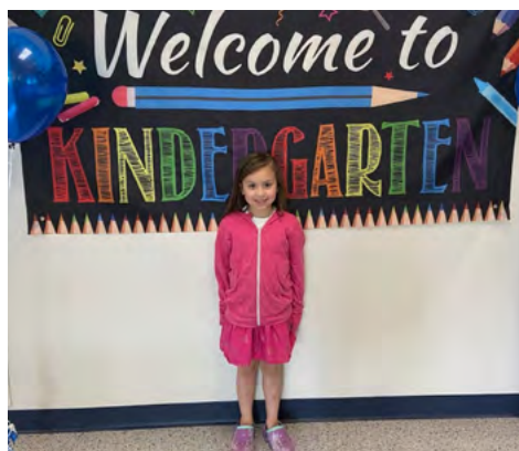
Whitehouse Primary School