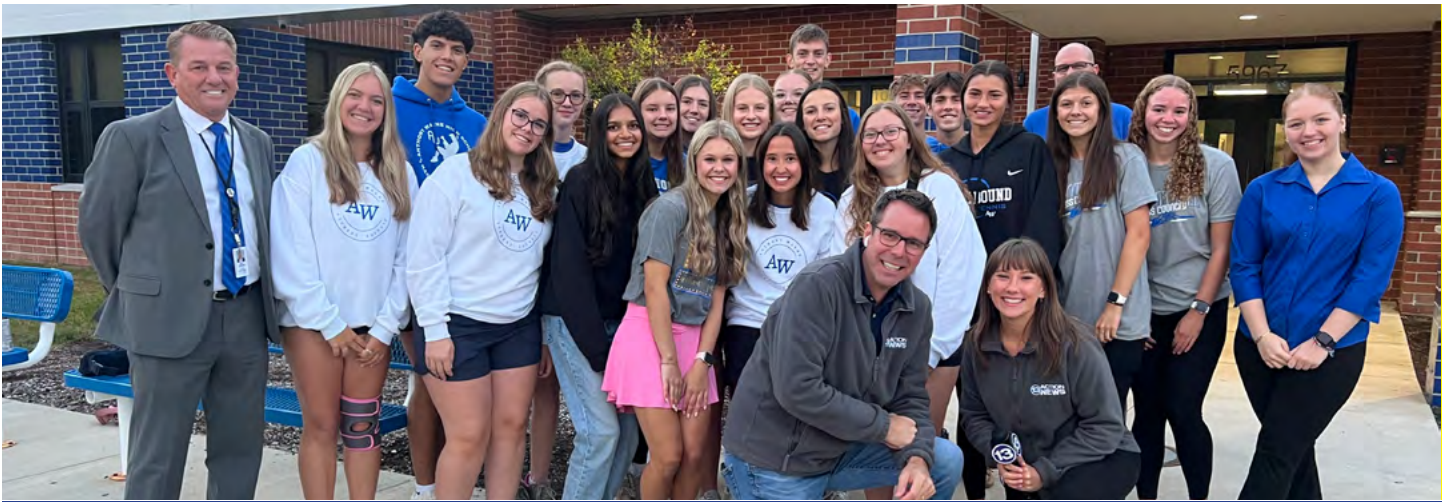
AWHS students representing Cross Country, Tennis, Band, DECA and Student Council got up early on the first day of school to take part in live interviews with 13abc, where they discussed their goals for the year.