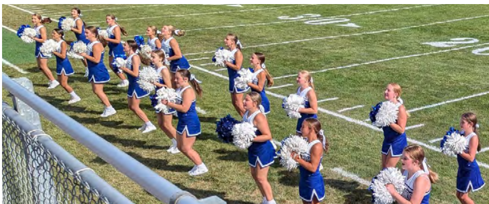
Anthony Wayne Junior High School