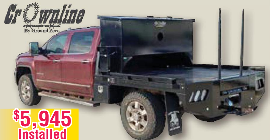
2024 Crownline 8' Spike Bed