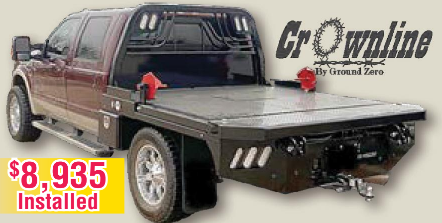
2024 Crownline 8' Arm Bed Single Wheel