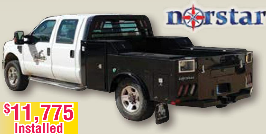
Norstar SD 8' Skirted Bed Single Wheel