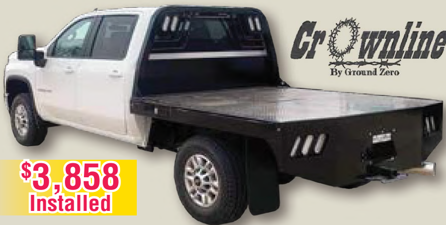
2024 Crownline 8' RubRail Bed Single Wheel