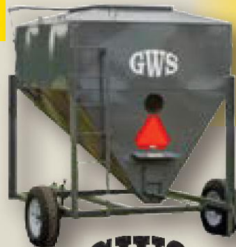
GWS Portable Feed Bin