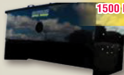
2024 Crownline Feeder Available In 3 Sizes 1,000 Lb., 1,500 Lb., 2,000 Lb.