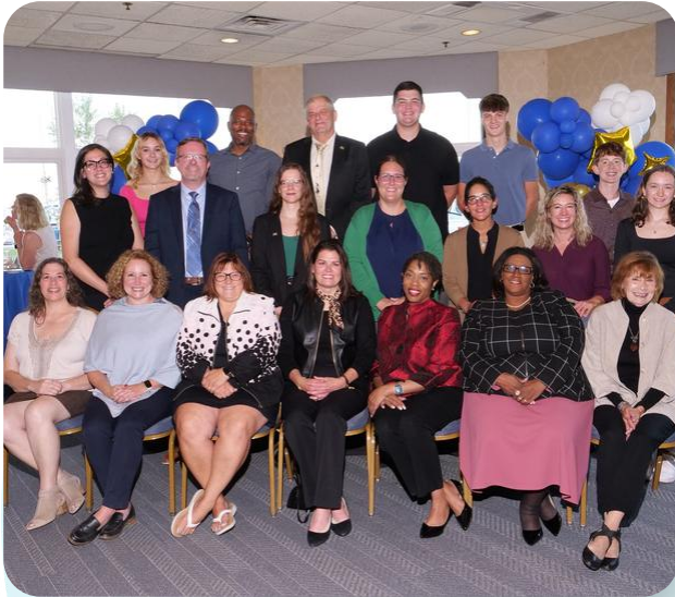
SEPTEMBER 25 TH ERIE COUNTY COMMUNITY FOUNDATION 30 TH ANNIVERSARY CELEBRATION