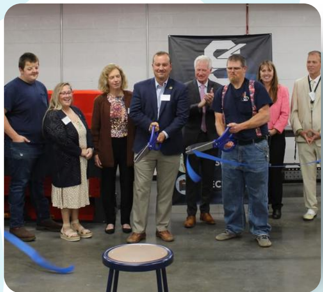
OCTOBER 16 TH SANDUSKY CITY SCHOOLS WELDING LAB GRAND OPENING