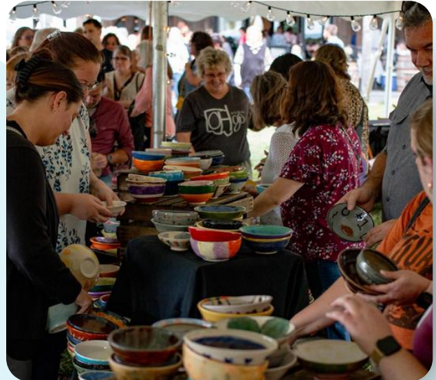
OCTOBER 6 TH OHgo 10 TH ANNIVERSARY CELEBRATION