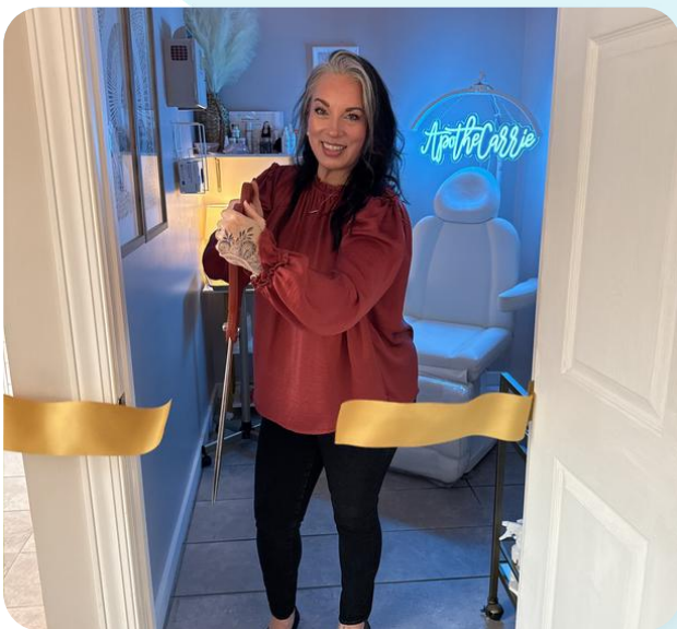
OCTOBER 15 TH APOTHECARRIE LLC GRAND OPENING CELEBRATION