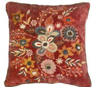
ROSE GARDEN 50X50