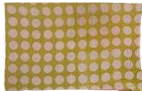
60X40 EUR 12