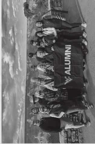
West Virginia University alumni on Orbridge's Southwest National Parks 2024 travel program.

PRSRT STD U.S. POSTAGE PAID PERMIT NO. 825 SAN DIEGO, CA