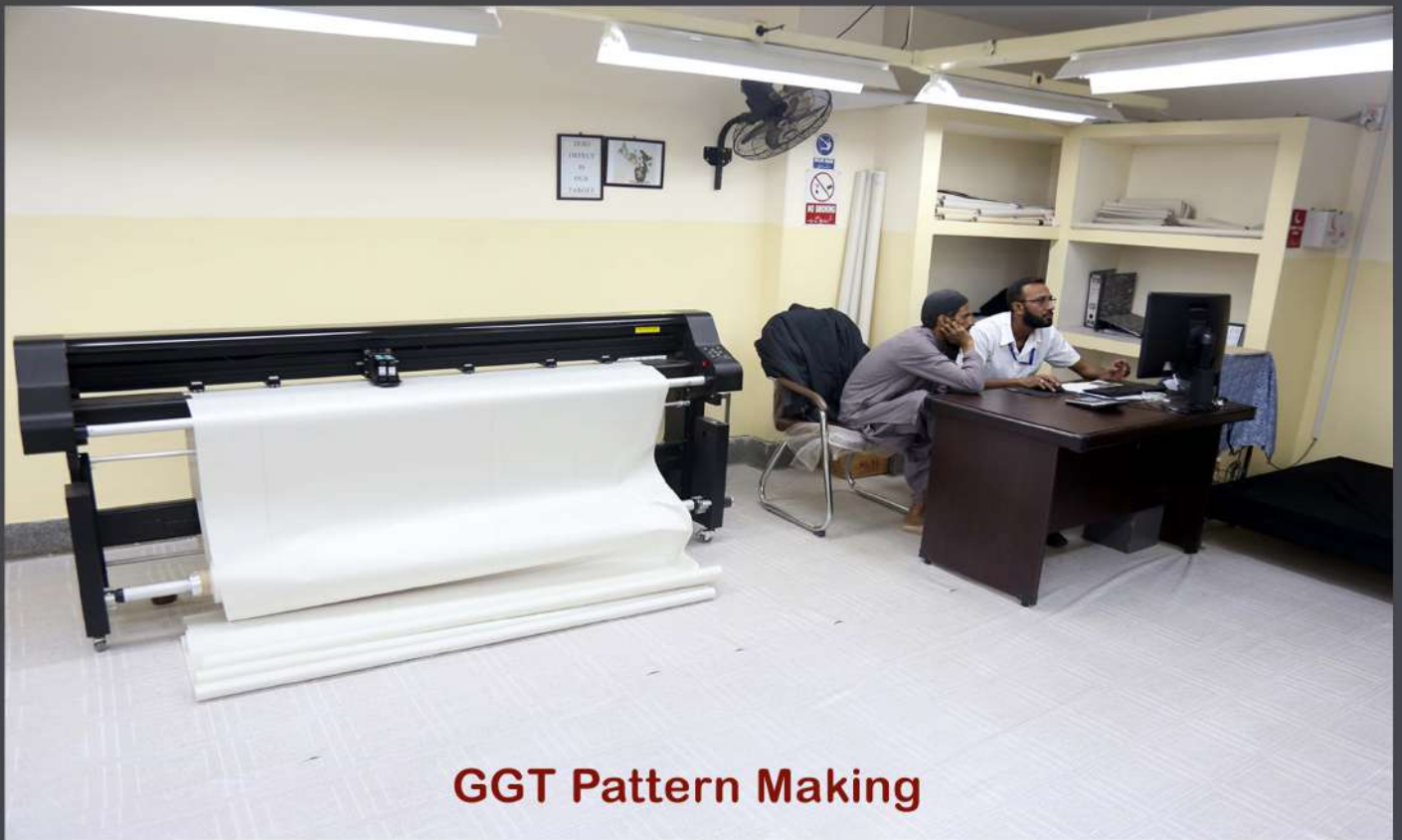
GGT Pattern Making