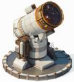
Cloud cost brokering

Elemento's disruption is built on top of a set of features driven by market needs and implemented with absolute genius: