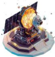
Private Cloud infrastructure