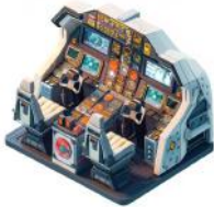
Unified Cloud management