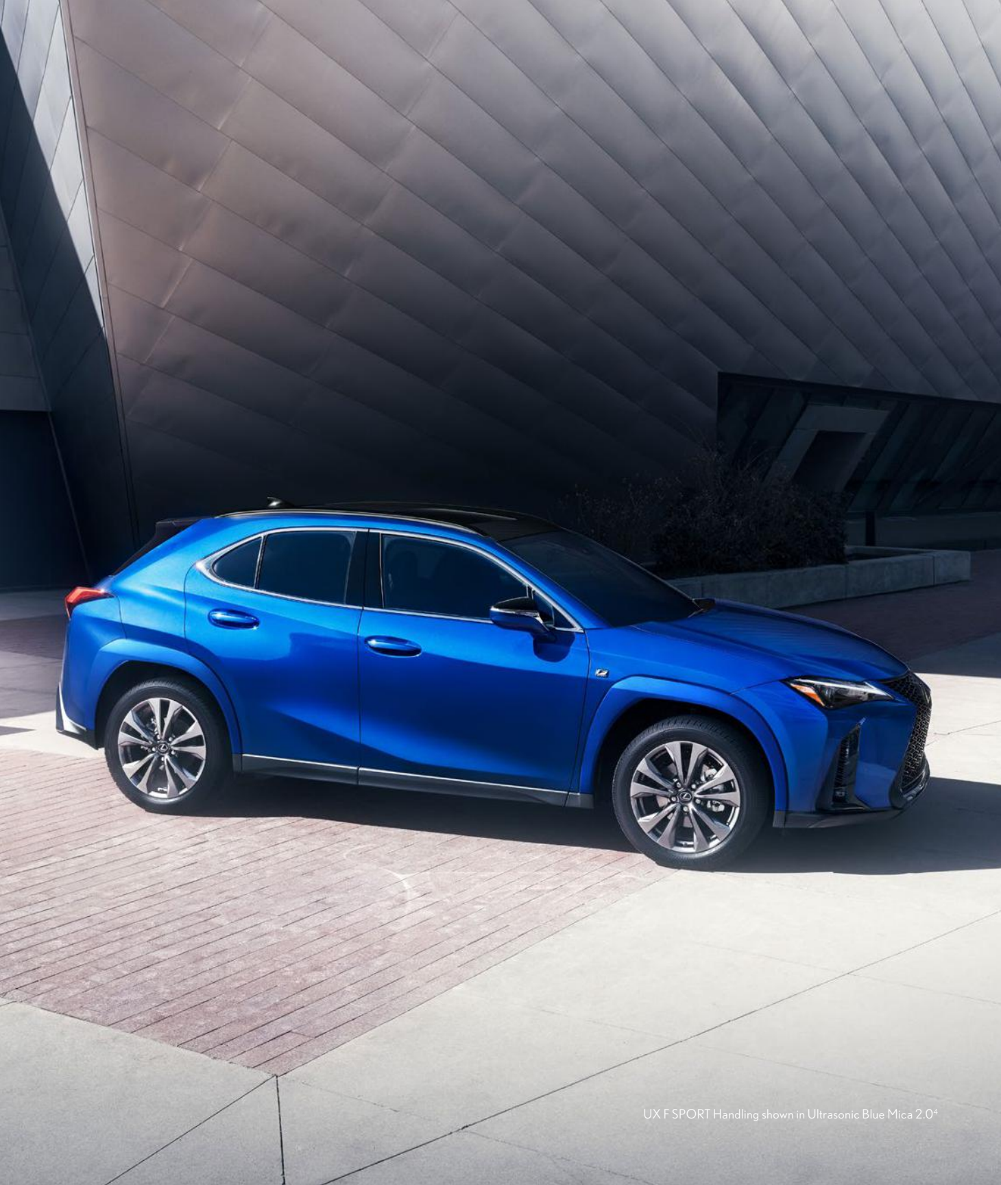
UX F SPORT Handling shown in Ultrasonic Blue Mica 2.0 4