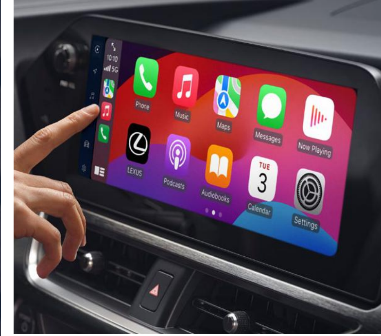
UX F SPORT Design shown in Ultra White 4