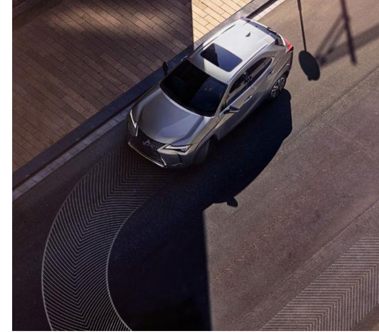
UX F SPORT Handling shown in Ultrasonic Blue Mica 2.0 4