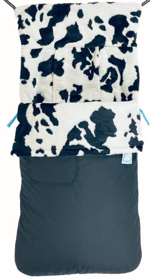
Moo SKU: BSFM-EX-0009