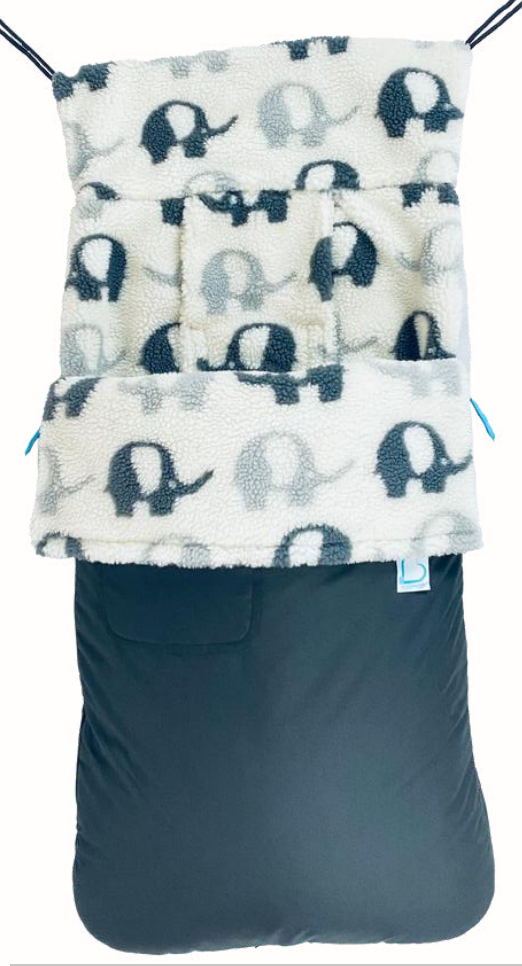
Elephant Stomp SKU: BSFM-EX-0005