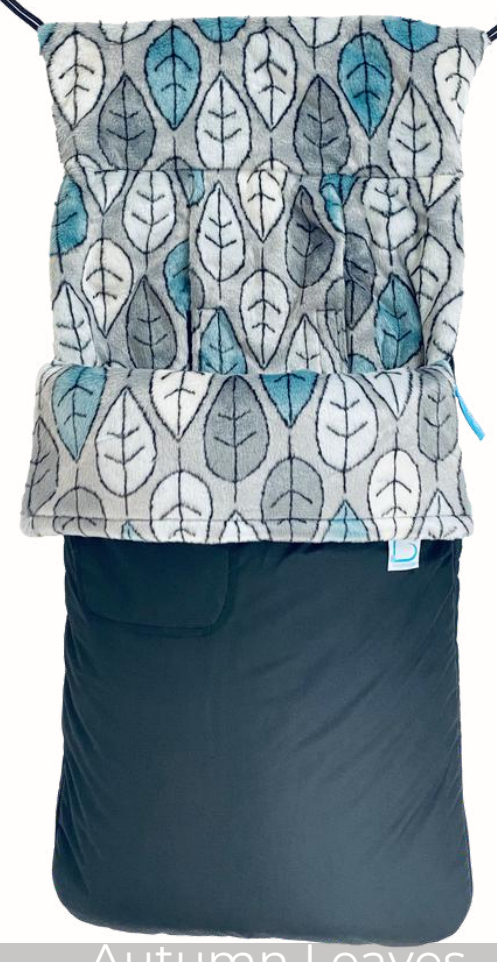
Autumn Leaves SKU: BSFM-EX-0010