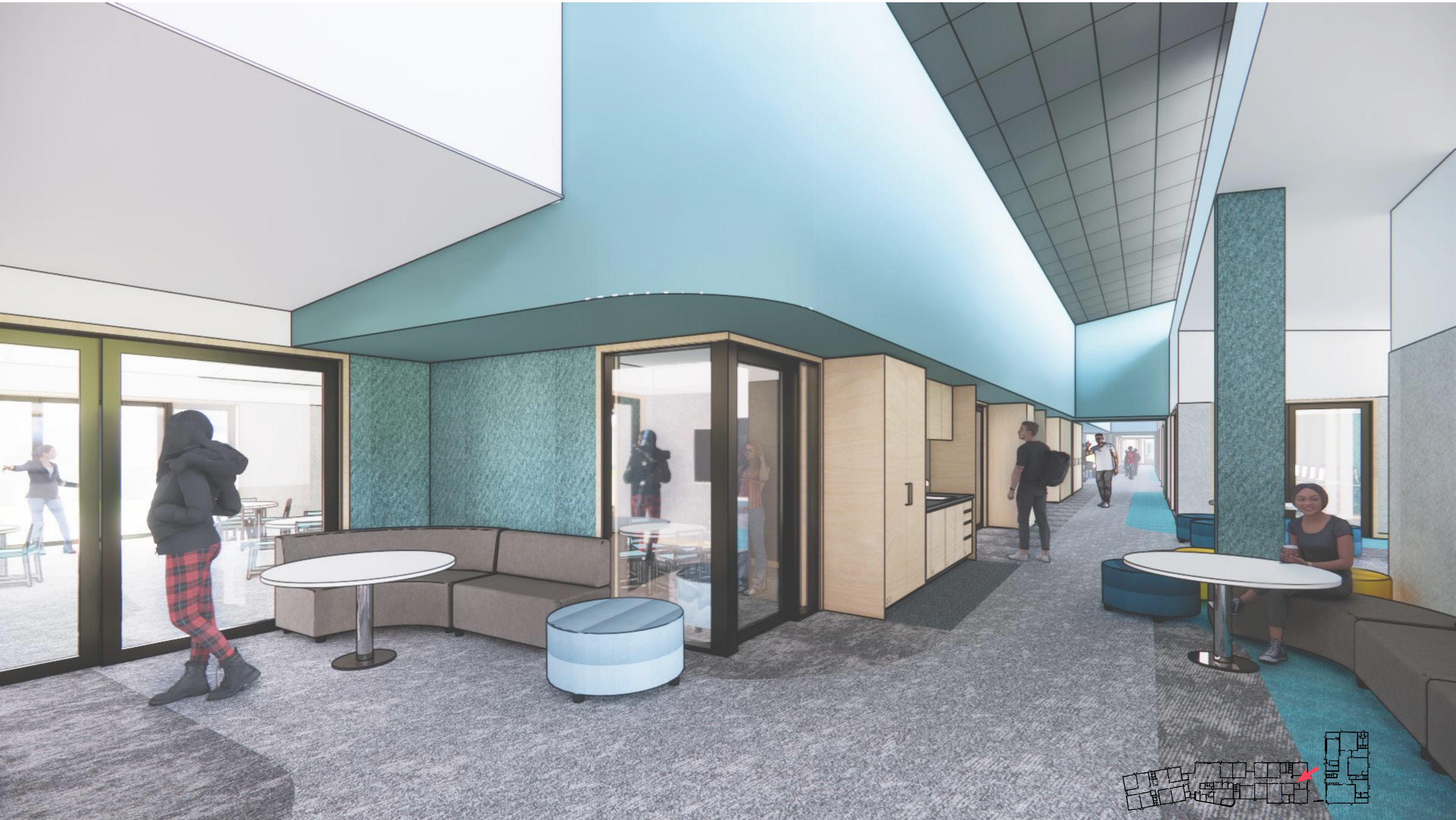
Senior corridor space