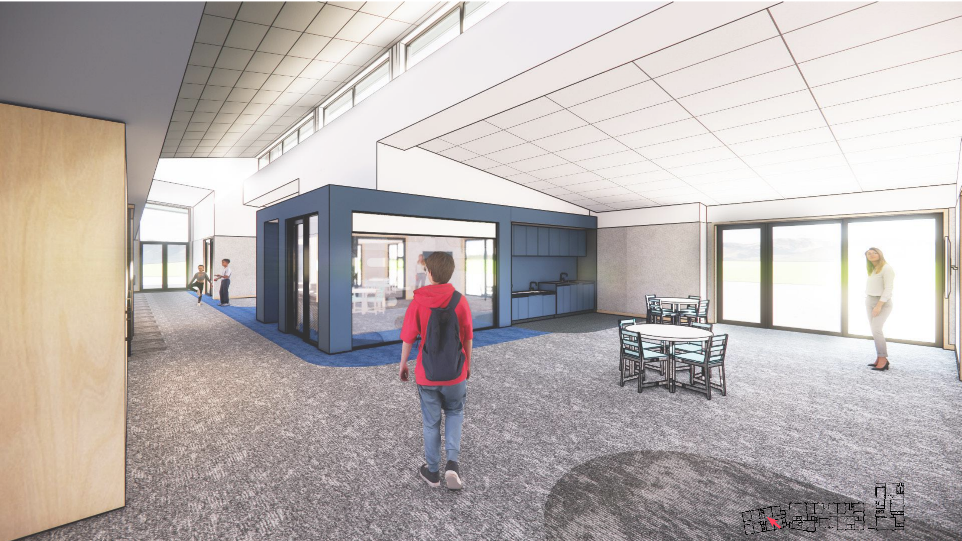
Junior project work-space