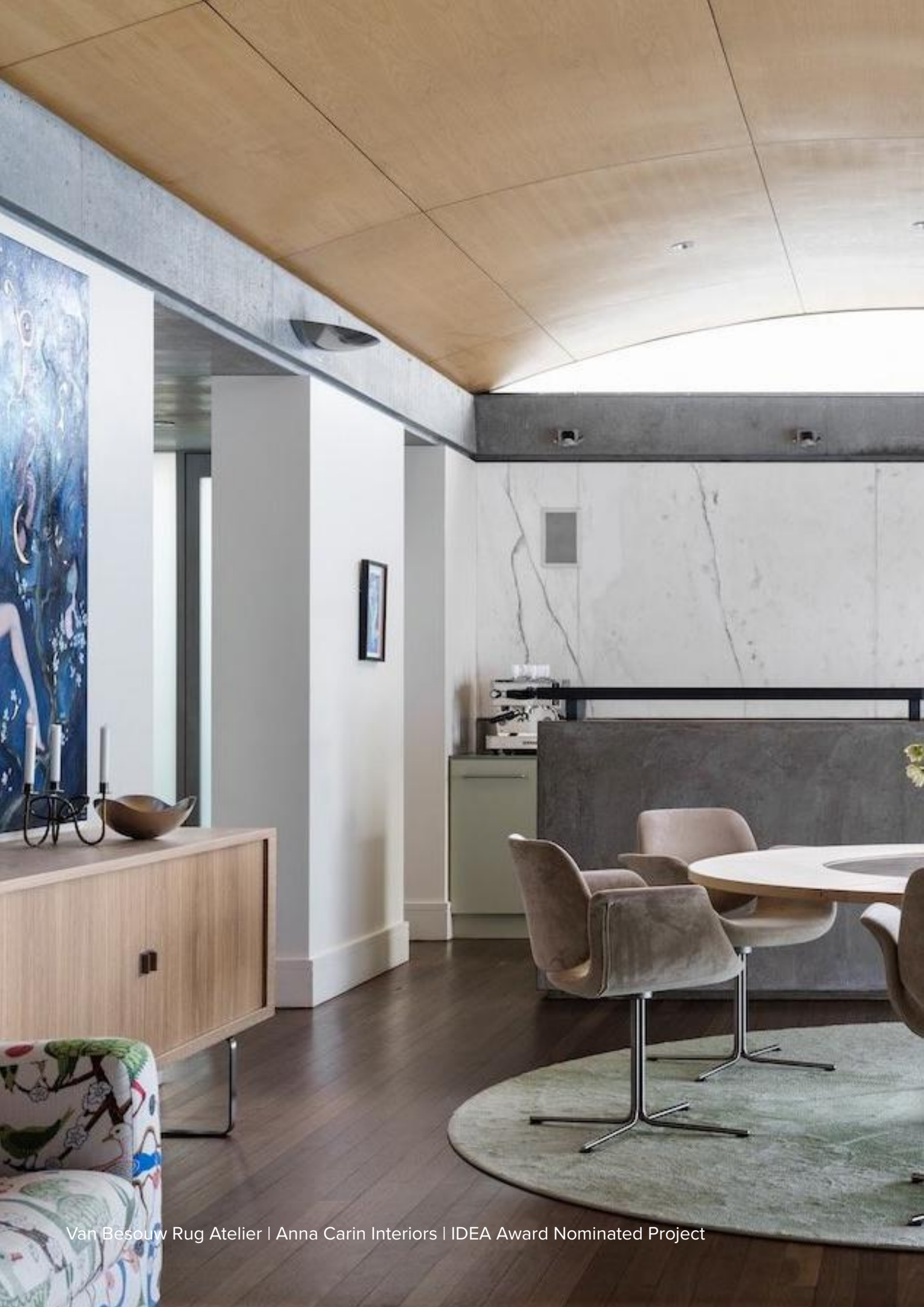
Van Besouw Rug Atelier | Anna Carin Interiors | IDEA Award Nominated Project