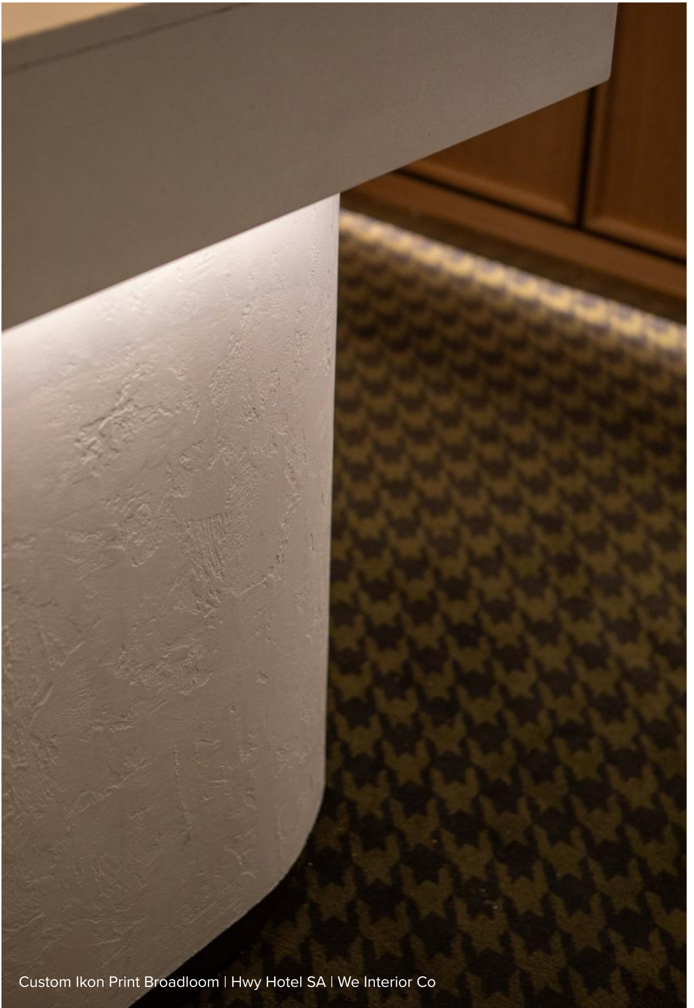
Custom Ikon Print Broadloom | Hwy Hotel SA | We Interior Co