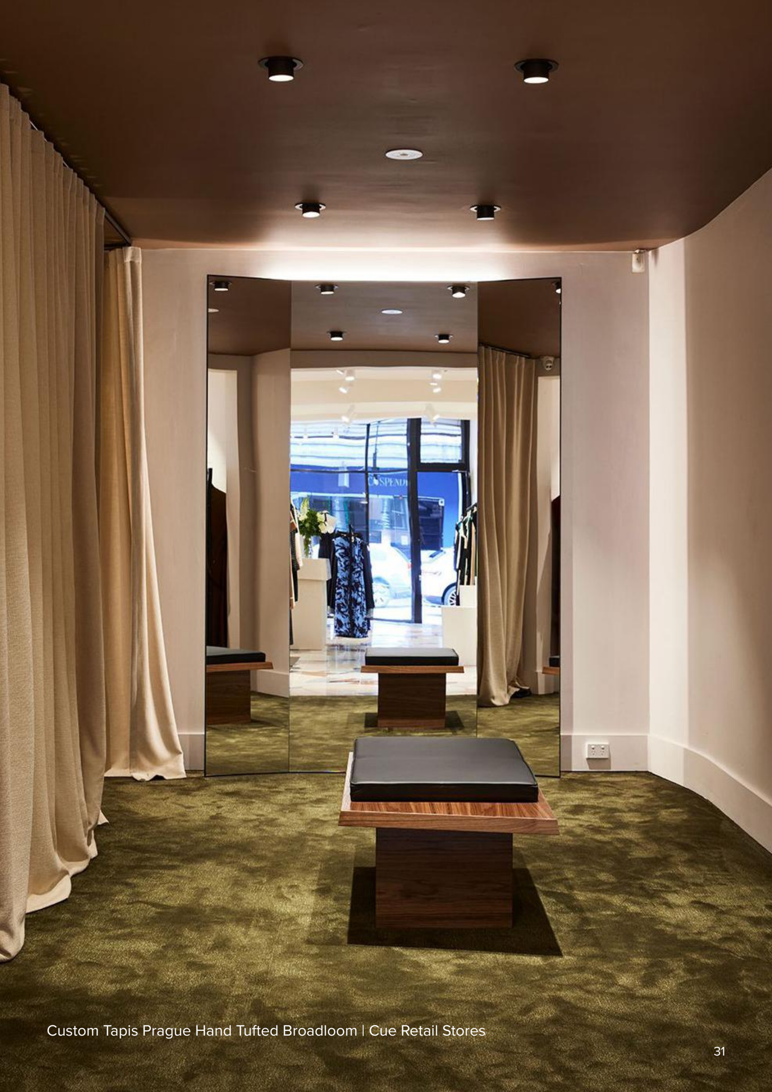
Custom Tapis Prague Hand Tufted Broadloom | Cue Retail Stores