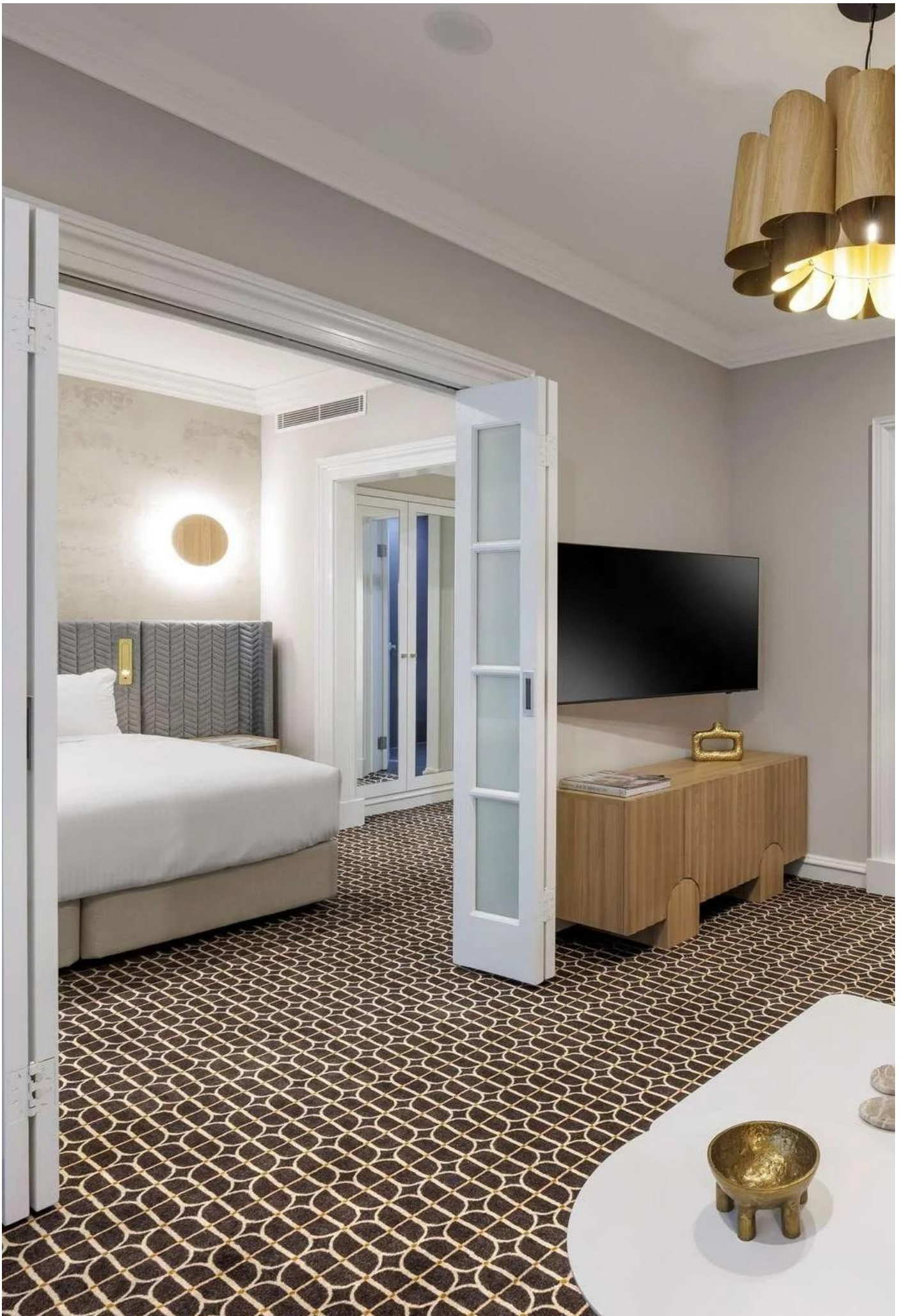
36 Custom Ikon Print Broadloom | The Sebel Hotel Flinders Lane | Studio del Castillo