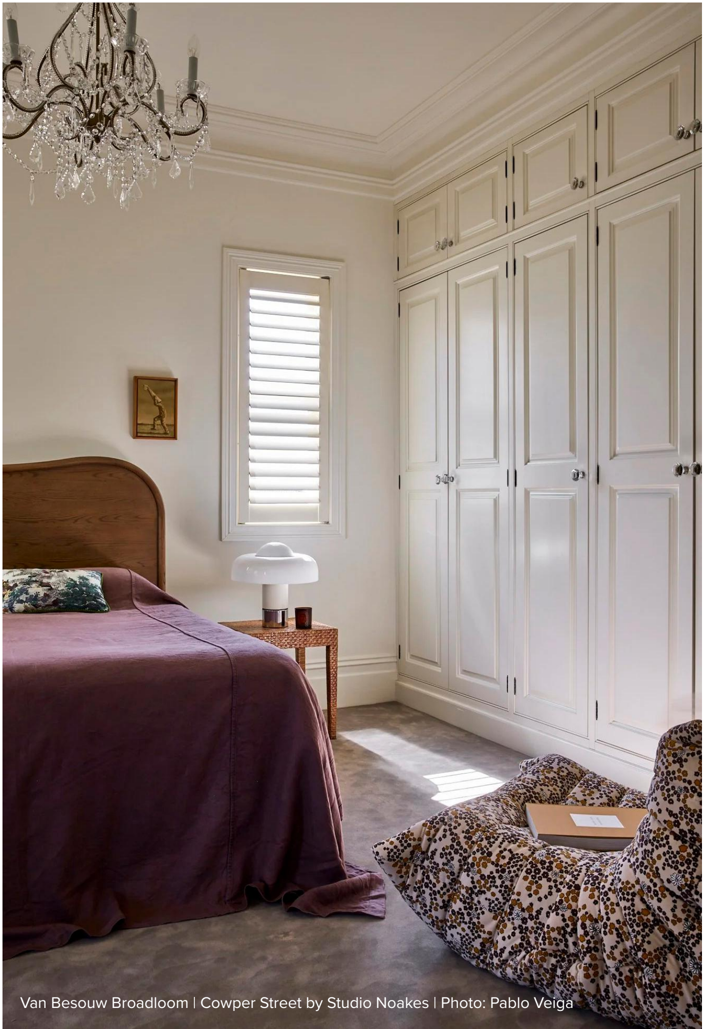
Van Besouw Broadloom | Cowper Street by Studio Noakes