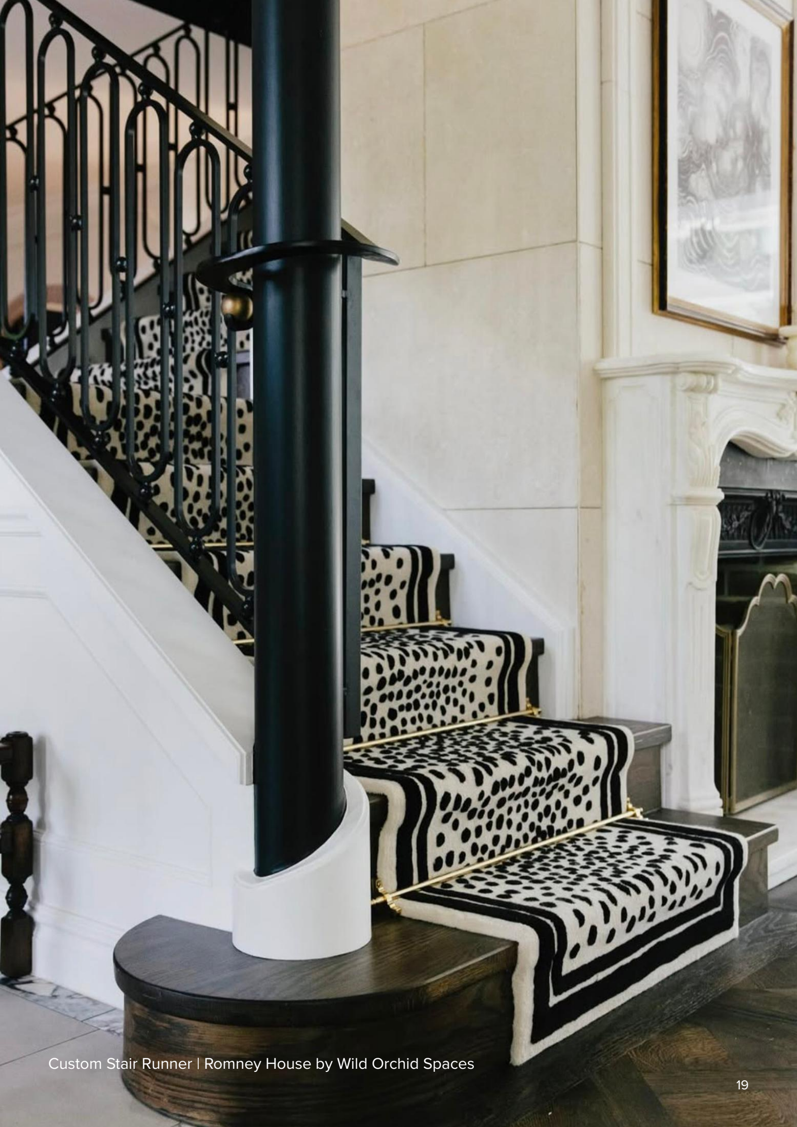
Custom Stair Runner | Romney House by Wild Orchid Spaces