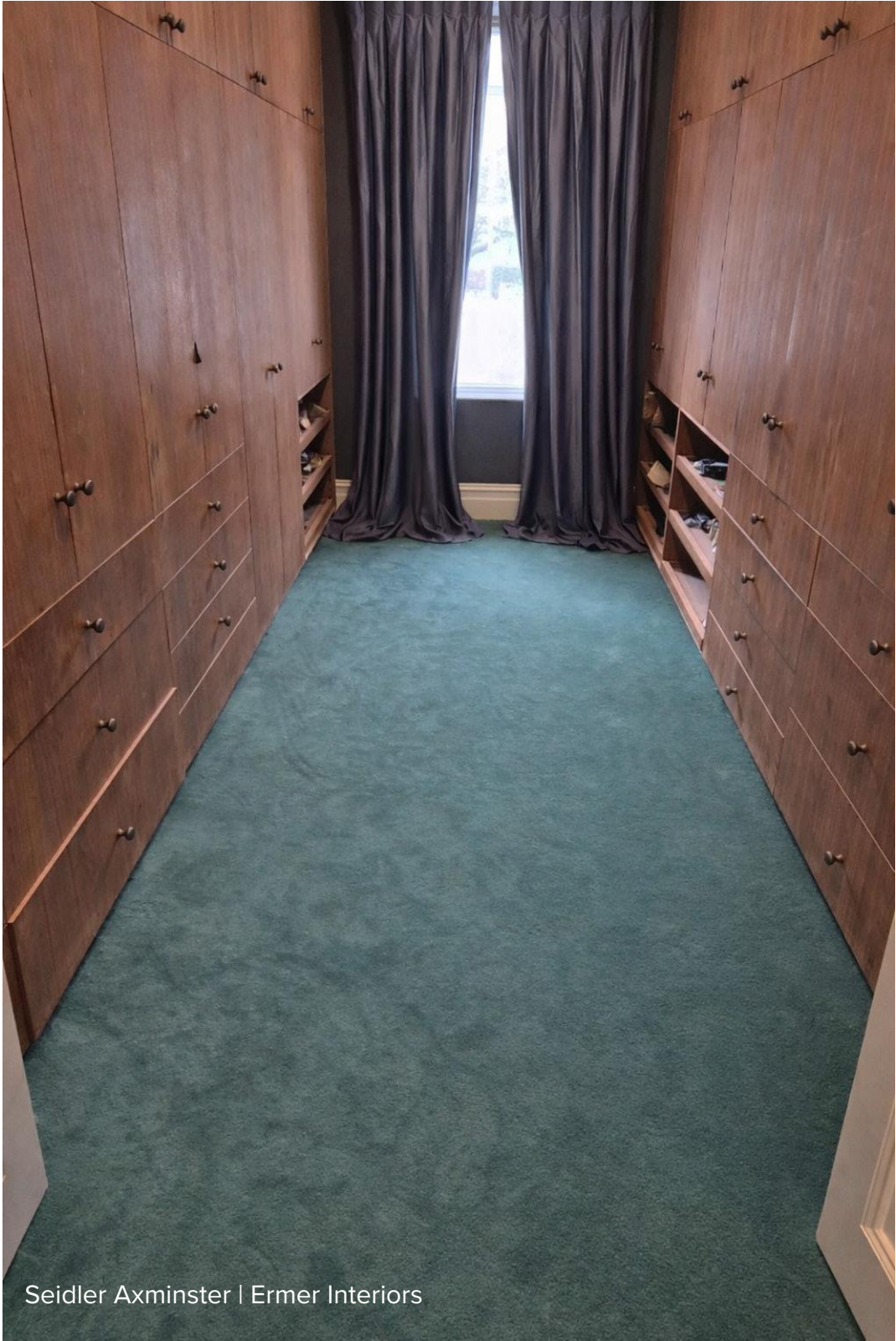
Seidler Axminster | Ermer Interiors