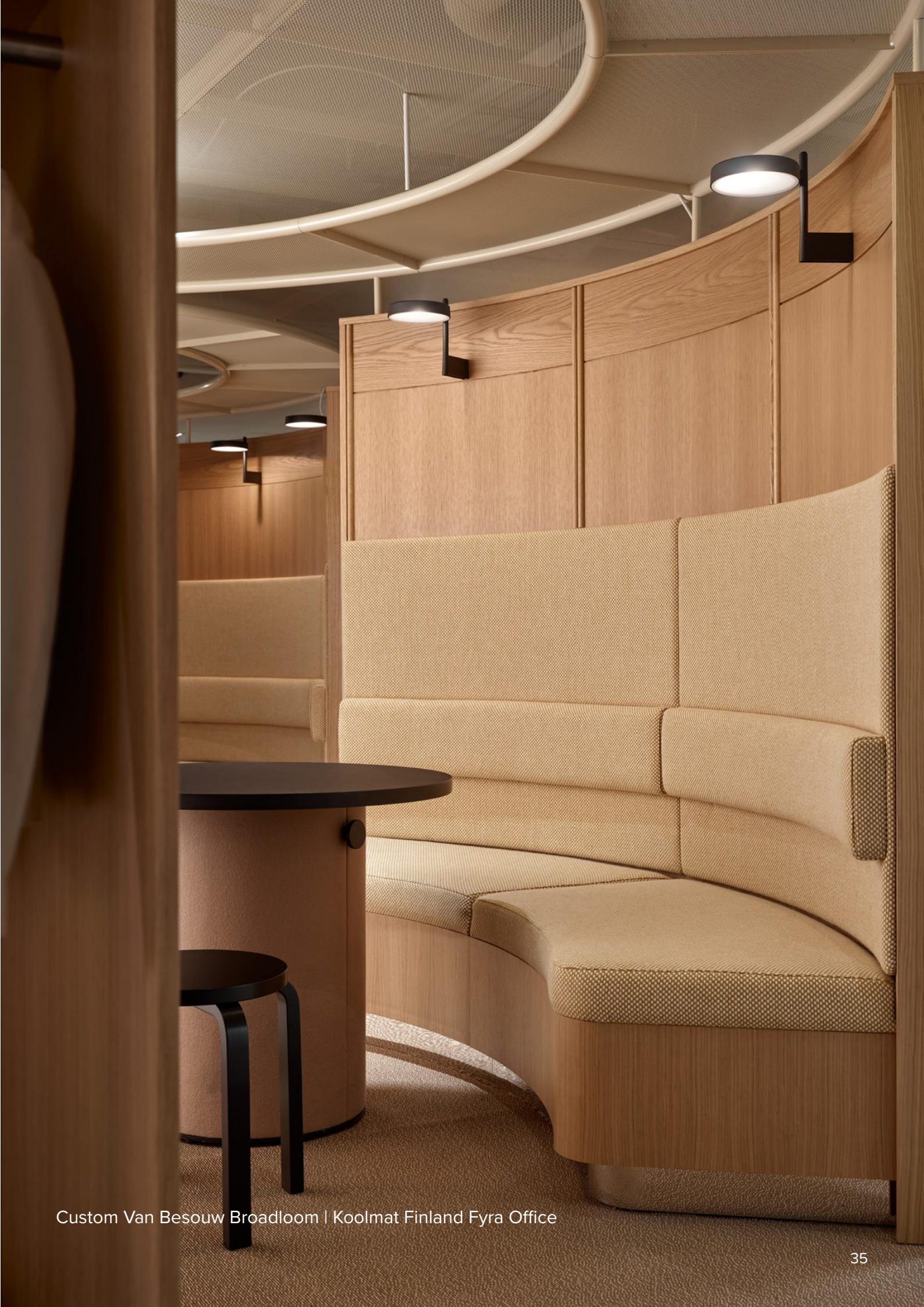
Custom Van Besouw Broadloom | Koolmat Finland Fyra Office