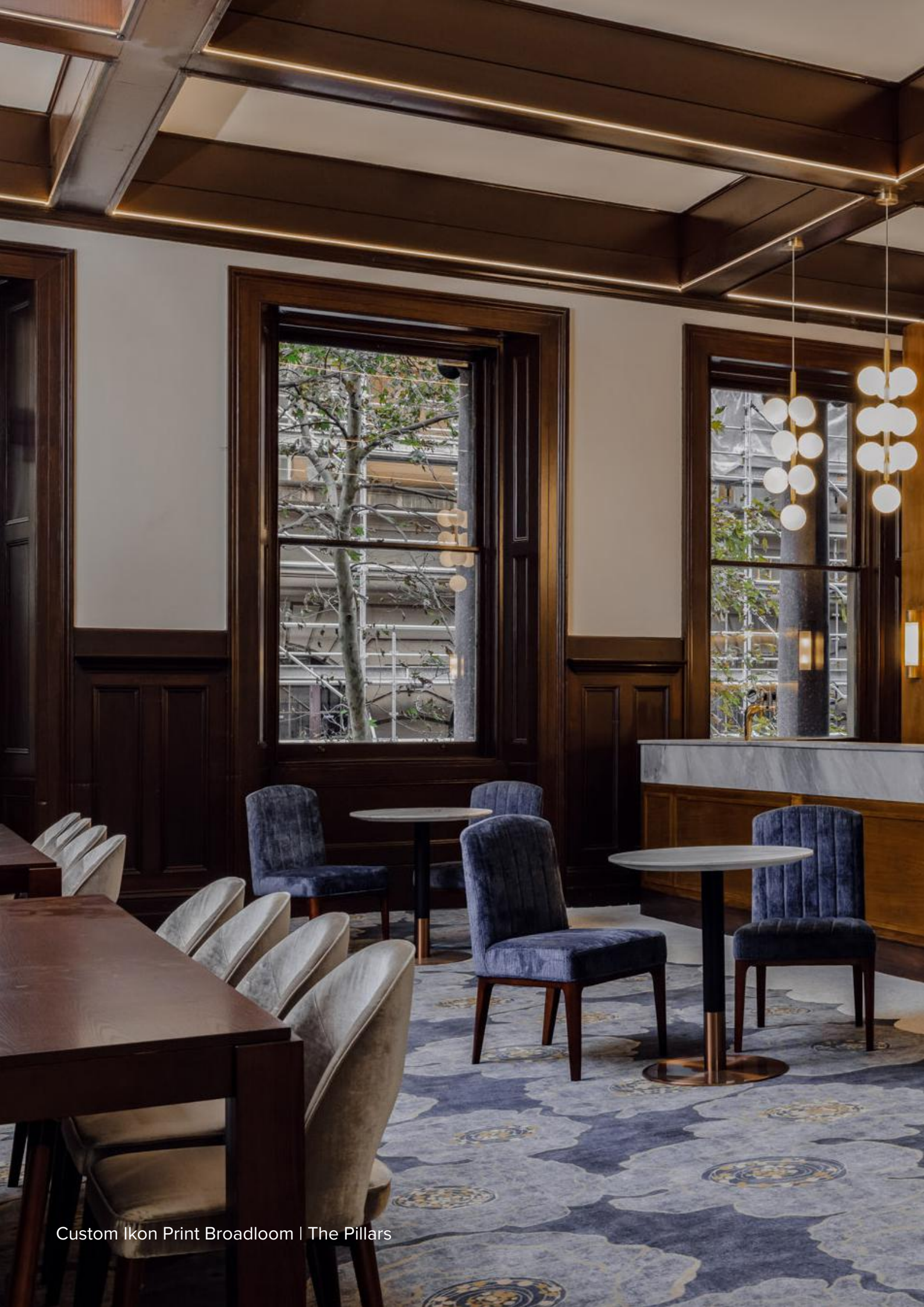
Custom Ikon Print Broadloom | The Pillars