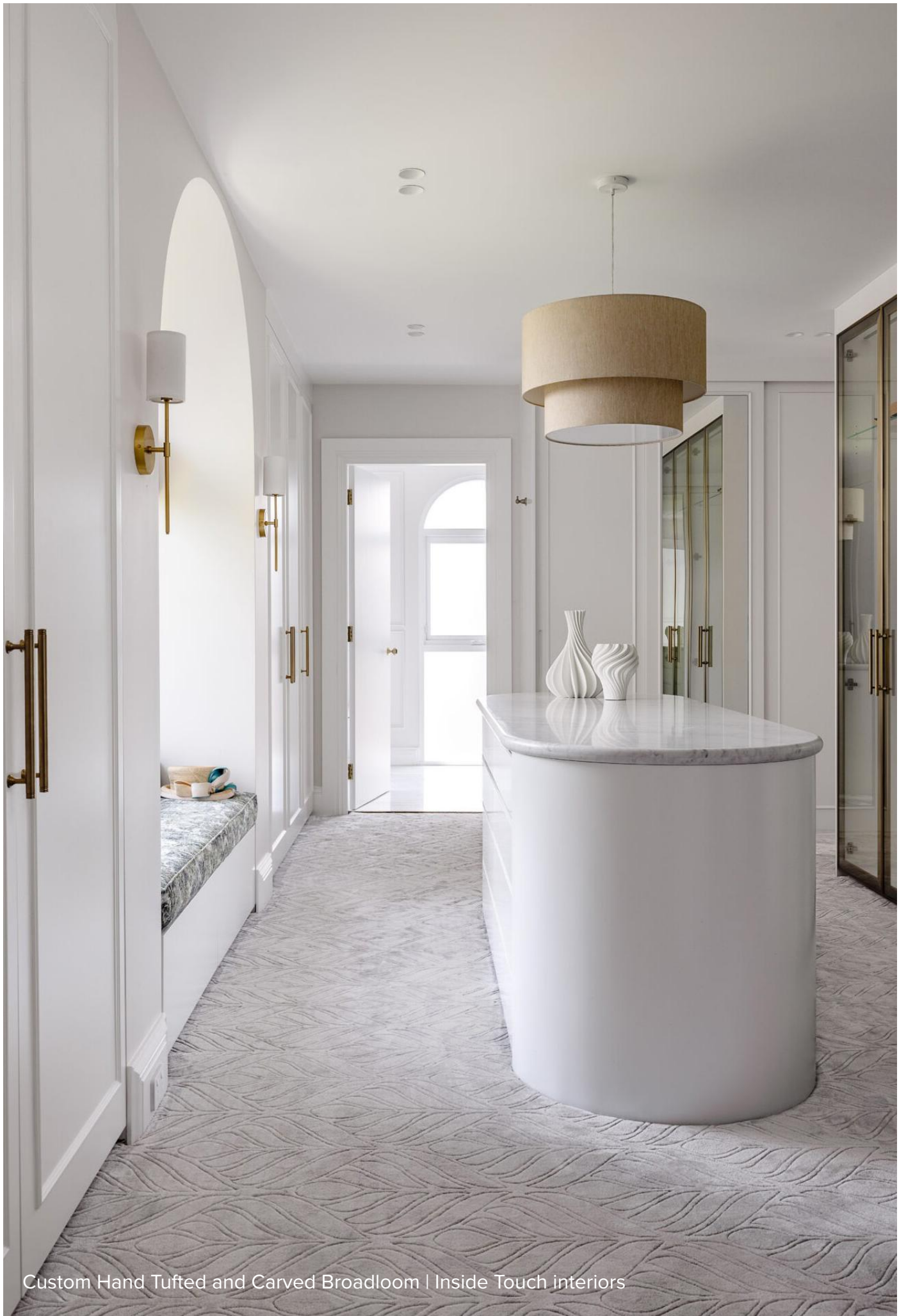
Custom Hand Tufted and Carved Broadloom | Inside Touch interiors