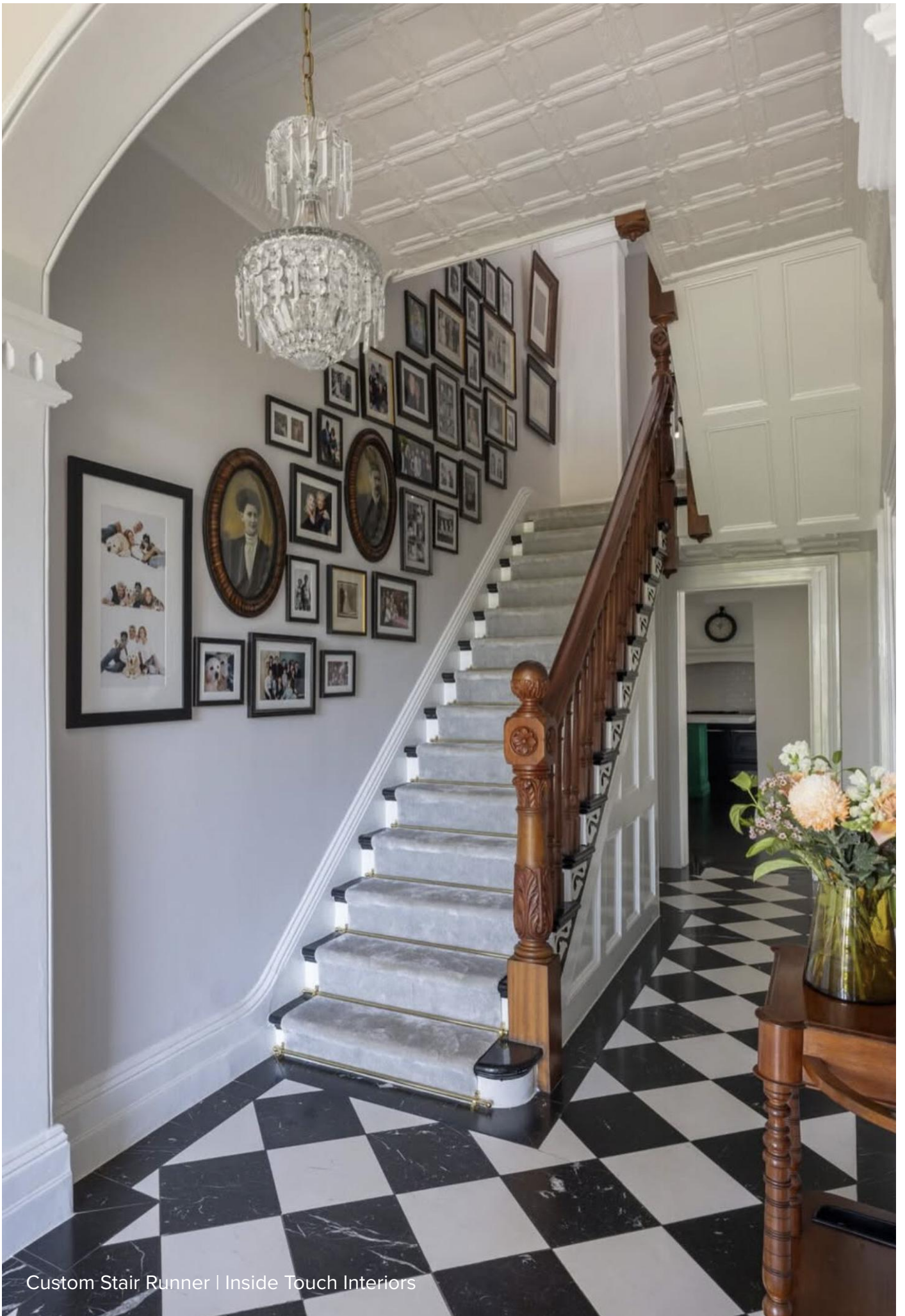
Custom Stair Runner | Inside Touch Interiors