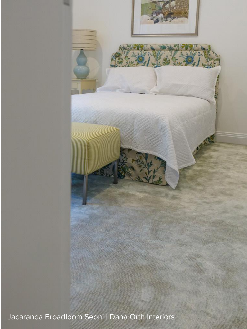
Jacaranda Broadloom Seoni | Dana Orth Interiors