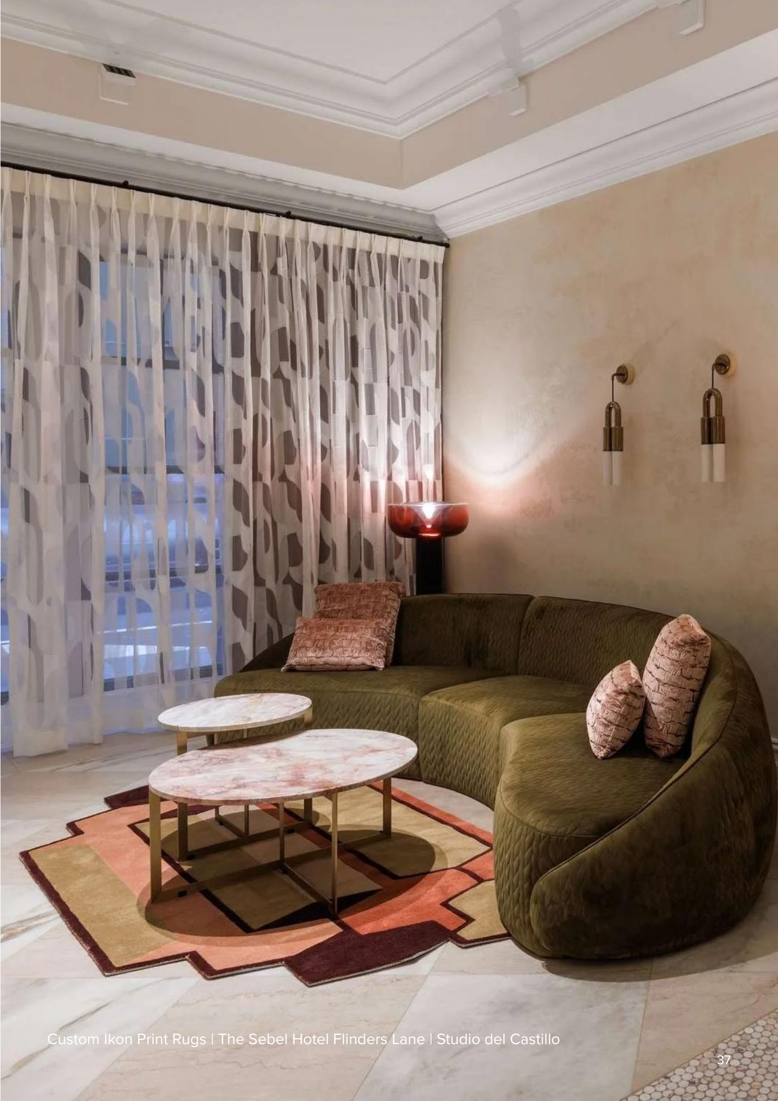
Custom Ikon Print Rugs | The Sebel Hotel Flinders Lane | Studio del Castillo