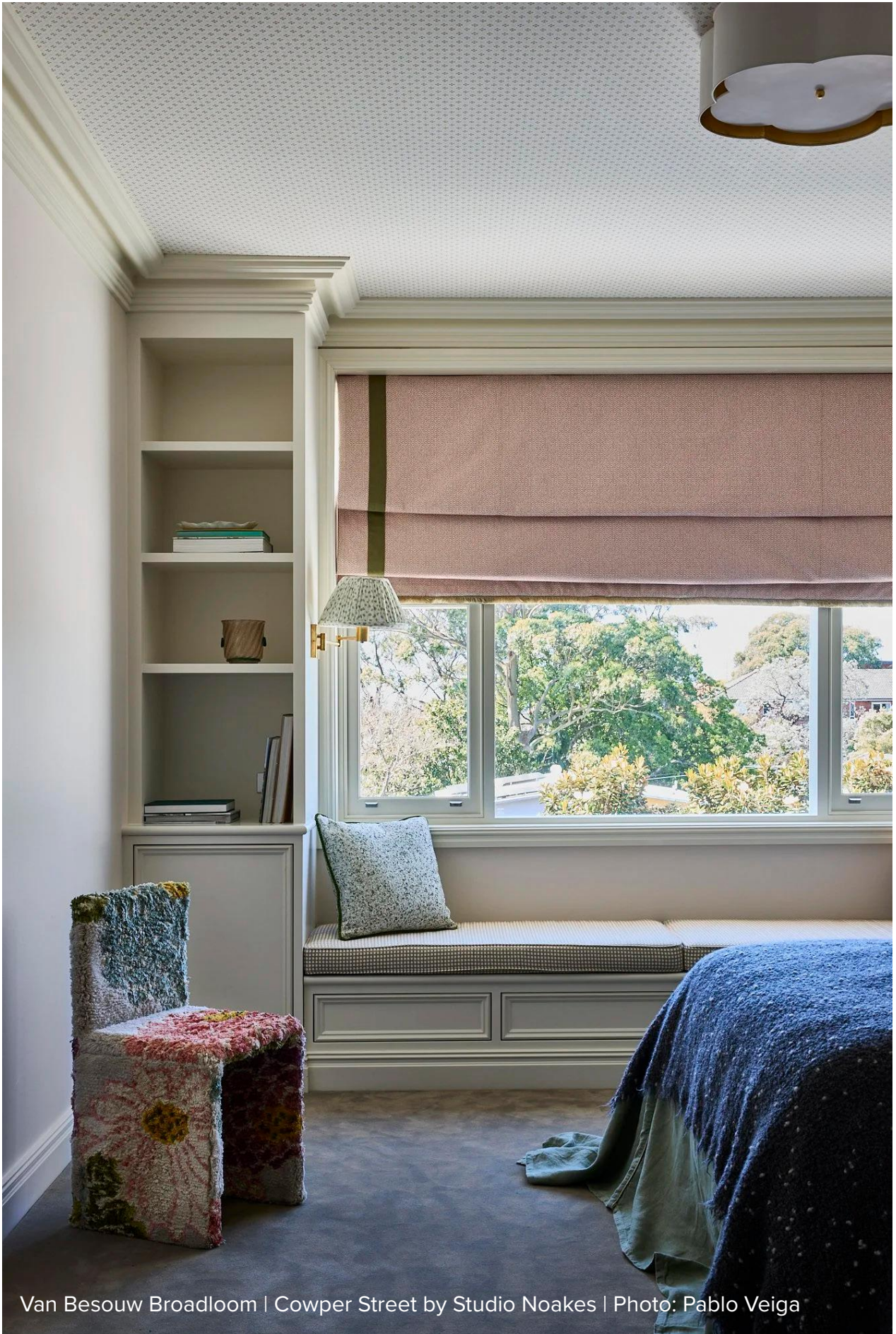
Van Besouw Broadloom | Cowper Street by Studio Noakes