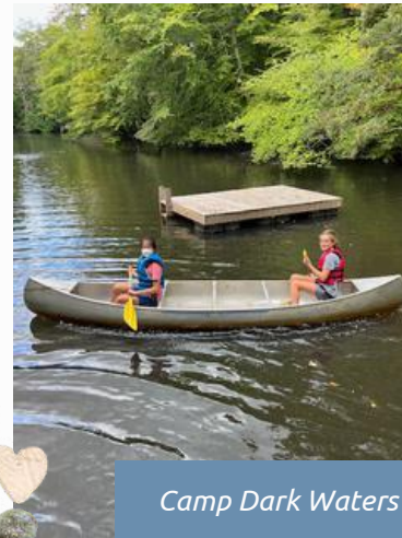
Camp Dark Waters