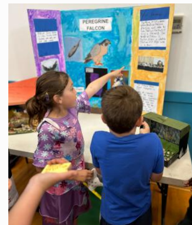
First grade students present on their Project-based learning study on Endangered Species