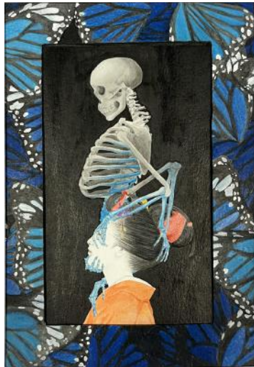
Metamorphosis: Butterfly by Keiko N. 1st Place, Grades 11-12, Teen Art Show 2023