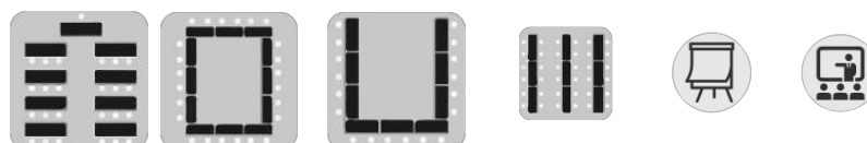
Large Meeting Room layout and facilities