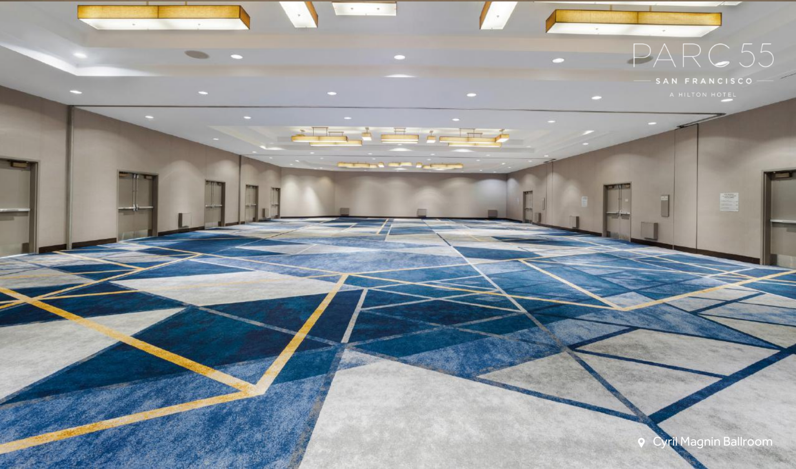
📍 Cyril Magnin Ballroom