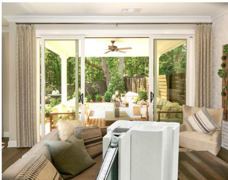
Signature optional upgrade