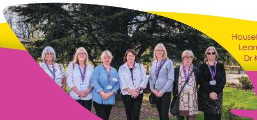
Housekeeping Team Learning Day at Dr Kershaw's Hospice

"It means so much to now give back through my work."