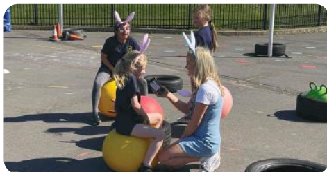
BBC Radio Manchester Visiting Dowson Primary Academy