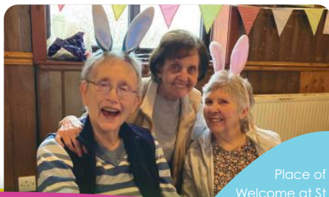
Place of Welcome at St Gabriels Church