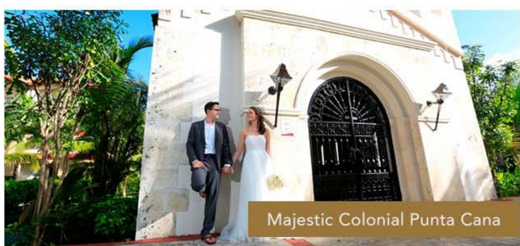
Majestic Colonial Punta Cana

If there's one thing everyone loves about weddings (besides cake), it's dancing all night long! That's why having your setting and dance floor is a fantastic way to celebrate with friends and family in an air-conditioned space.