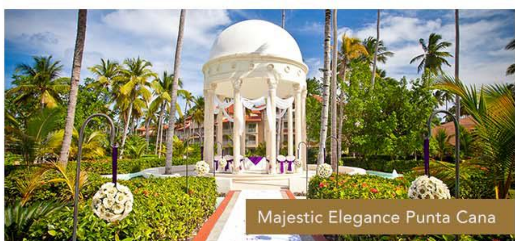
Majestic Elegance Punta Cana

This is one of the most popular options because it's close enough to our beautiful beaches but offers privacy and quietness.