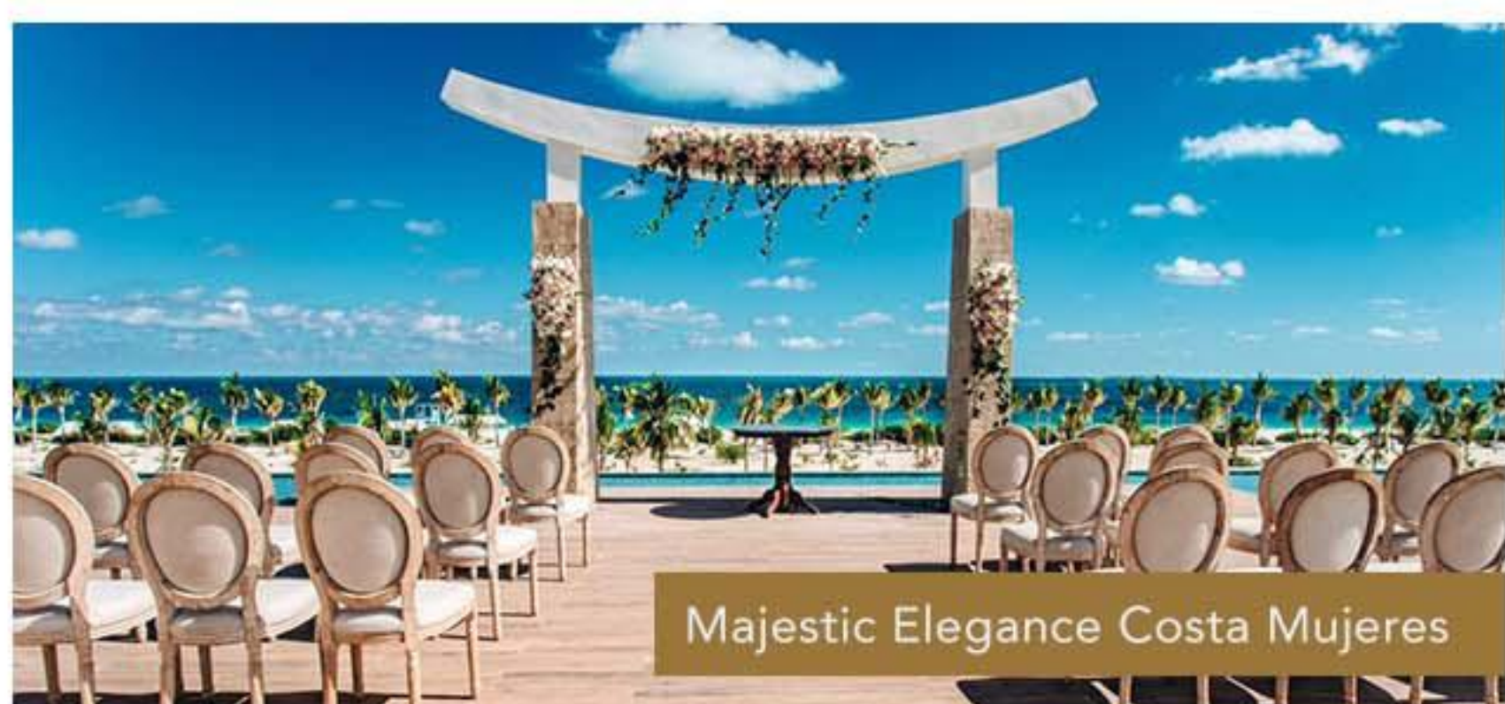
Majestic Elegance Costa Mujeres

This one offers not only a beautiful venue for your marriage, but it is also an ideal place to celebrate your union in harmony with Catholic traditions. Exclusively at Majestic Resorts Punta Cana, DR.