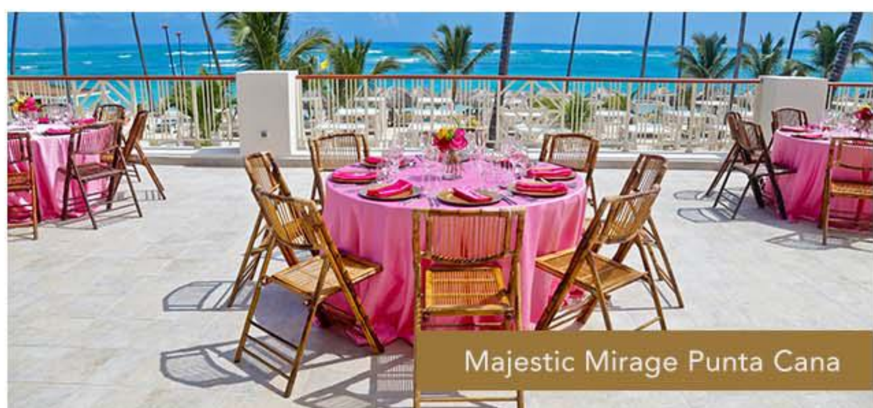
Majestic Mirage Punta Cana

This is the venue for brides looking for an unspoiled paradise with breathtaking views. Exclusively at Majestic Elegance Costa Mujeres.