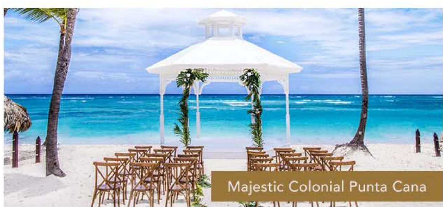
Majestic Colonial Punta Cana

Choose from our picturesque ceremony locations including: