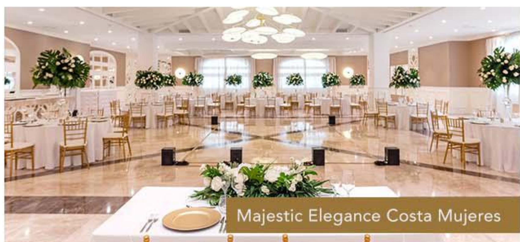
Majestic Elegance Costa Mujeres

If an outdoor wedding surrounded by natural beauty is what you're looking for, then this might be right up your alley!