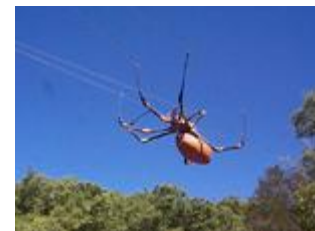
Zoos, museums and wildlife centres