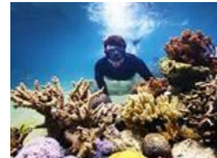
Aquariums, marine and wildlife parks