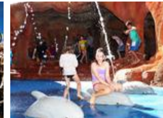
Childcare, schools, playgrounds and water play areas