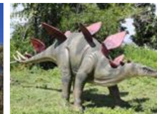
Theme parks and holiday resorts