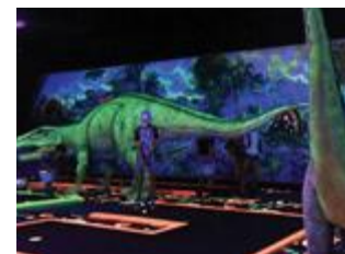
Mini-golf courses and entertainment centres