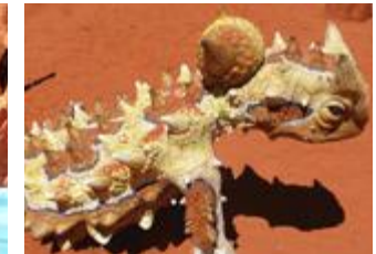
Cultural, historic and environmental interpretation centres