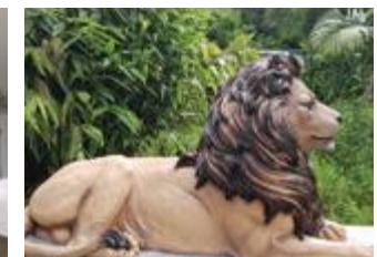
Residential home and garden decor