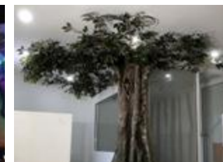
Shopping centres, offices, hotels, signs, commercial fitouts