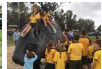
Township icons, tourist attractions and themed events

Please see our website for a wide range of project case studies .