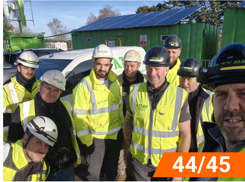
Sittingbourne Site Team

Meanwhile, at Natta's Sittingbourne Care Home project in Kent, the team achieved an outstanding score of 44 out of 45 in their recent Considerate Constructors Scheme inspection. We were awarded 'excellent' across the board. This result further reinforces the consistency of high standards being delivered across all sites.