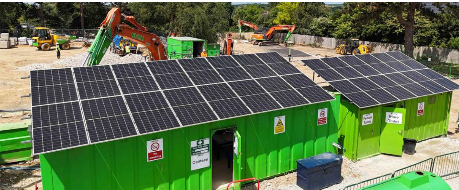
Solar PV Panels & Wind Turbine at our Sittingbourne Project

This recognition highlights the company's continued commitment to ESG (environment, social responsibility and governance) principles and its focus on delivering projects to high sustainability standards. It reflects the consistent efforts of Natta's teams to reduce environmental impact while improving efficiency across operations.