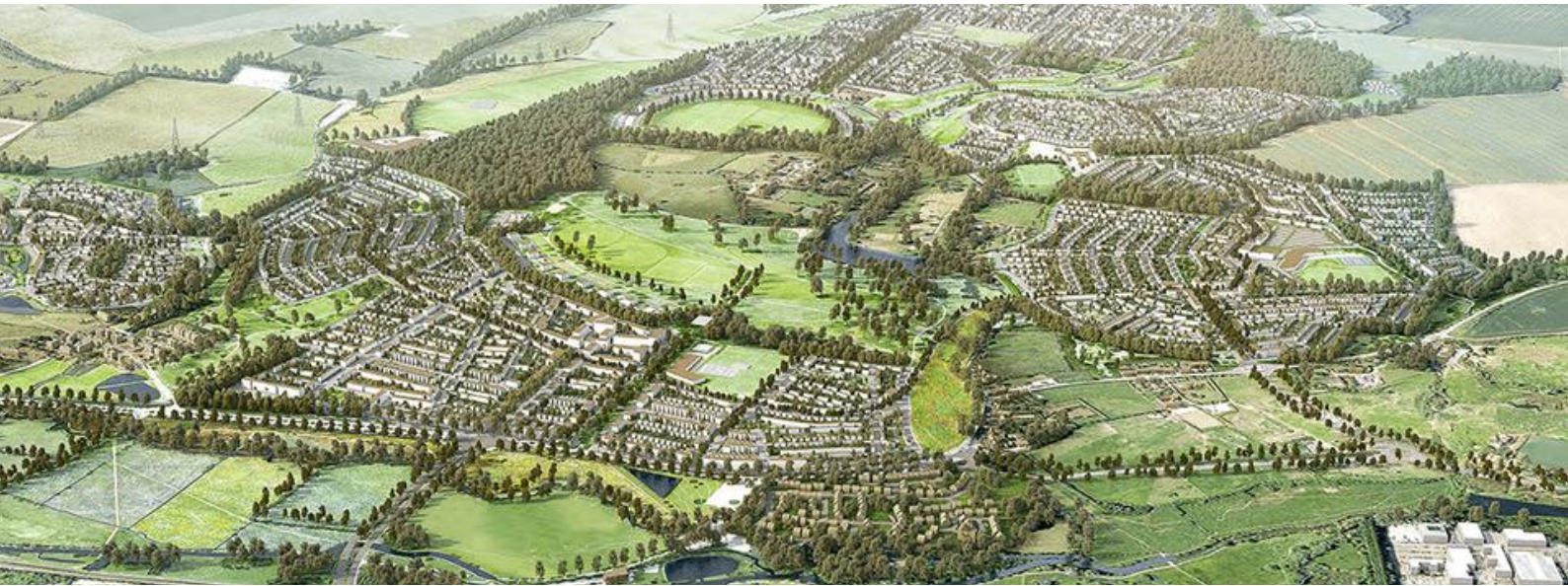
CGI of the Newly Proposed Gilston Development

Natta is delighted to share a major milestone in its continued growth, having been appointed by the Places for People (PfP) and Barratt Redrow Joint Venture as the Main Contractor for the delivery of key infrastructure works at the Gilston Park Estate development.