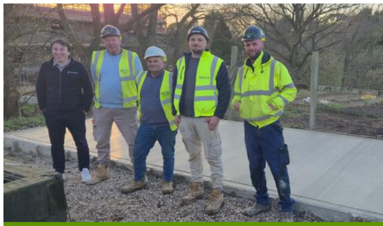
During and after the renovation work