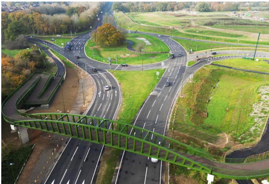
52-metre Vierendeel-Style Footbridge

Natta delivered the essential infrastructure for the North Horsham development . Our work included extensive Section 278 highway improvements, with the standout elements being the construction of a major roundabout and significant upgrades to the junction at Ruser Road and the A264. In addition to the highway upgrades, a major feature of this project was the installation of a 52-metre Vierendeel-style footbridge. These enhancements played a vital role in the primary access corridor, improving connectivity to and from the large-scale development site. We were also appointed to undertake the East-West Greenspace. This included the creation of a significant area of public open space, designed to include play parks, paths, pedestrian bridges, open watercourses and hard and soft landscaping.