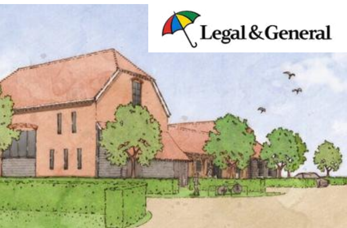
CGI of the Mowbray Community Centre

We are delighted to announce that Natta has won 2 new contracts at the Mowbray Development in North Horsham. These comprise the Bailey Road Extension Scheme and the build of the Mowbray Community Centre. Here, Natta is working as the main contractor for Master Developer, Legal and General . The Community Centre project will see us undertake the full design and build of an 8,000 sq. ft, purpose-built facility that will serve as a central hub for the growing local community.