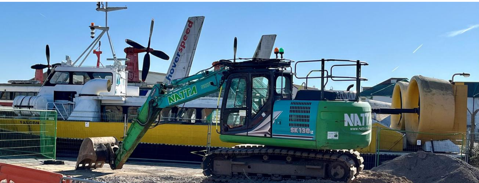
Daedalus Waterfront Site Photo of the Month Entry

As the Main Contractor, we are carrying out enabling works to support the development phases at Daedalus Waterfront, including constructing new bellmouths, new HV electric feed substations and drainage connections. We look forward to seeing the project progress and the positive impact it will bring to the area.