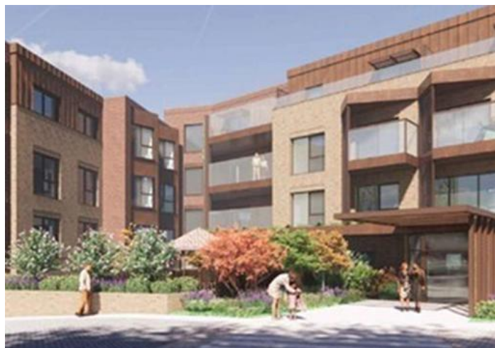
CGI of Epping Care Home

It often helps to build excitement and anticipation within the community for what will be delivered.