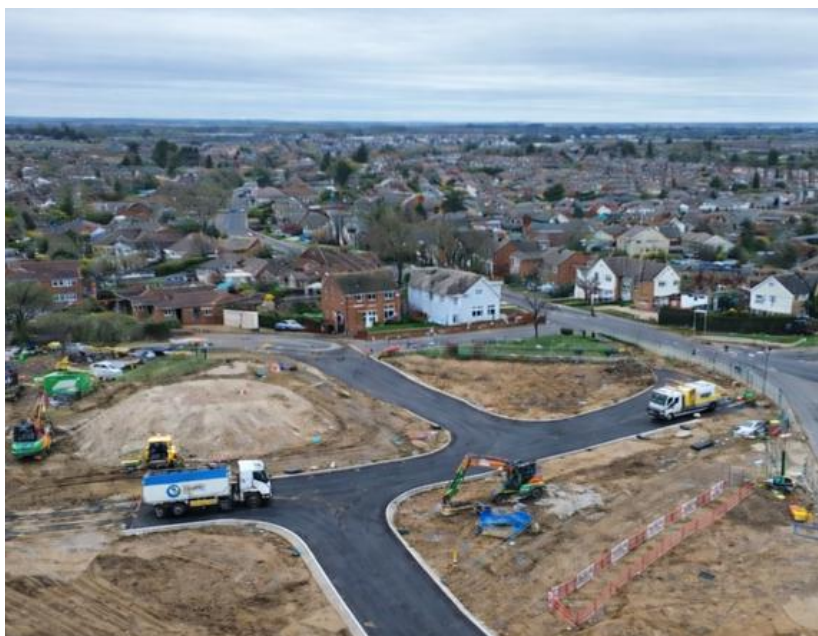
March Progress Photo from our Stanway Project

Along the spine road, we are focusing on the installation of the foul and storm drainage. On site, we have also set up a sustainable compound in which our Solar PV , Battery Storage and wind turbine systems power our welfare facilities.