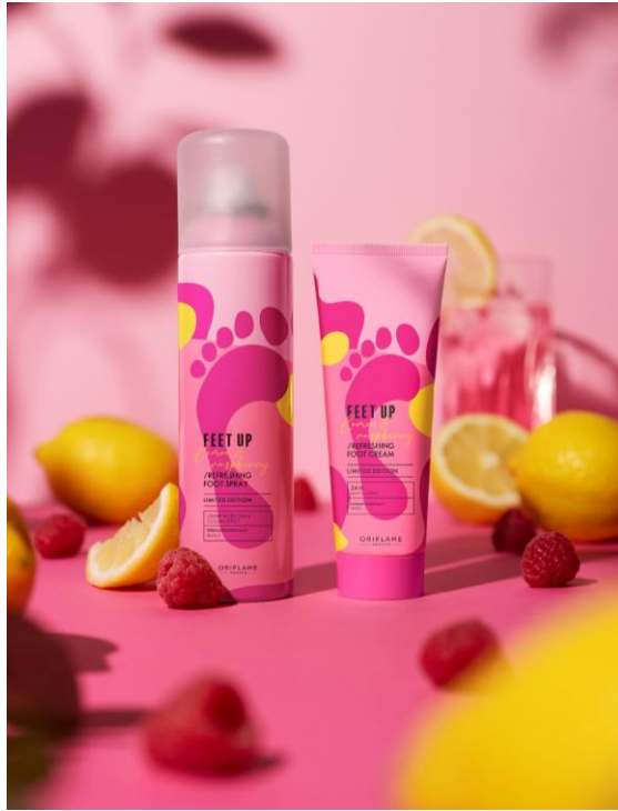
Raspberry & Lemon Summer Collection 2026 FAD: 1 March, 2026