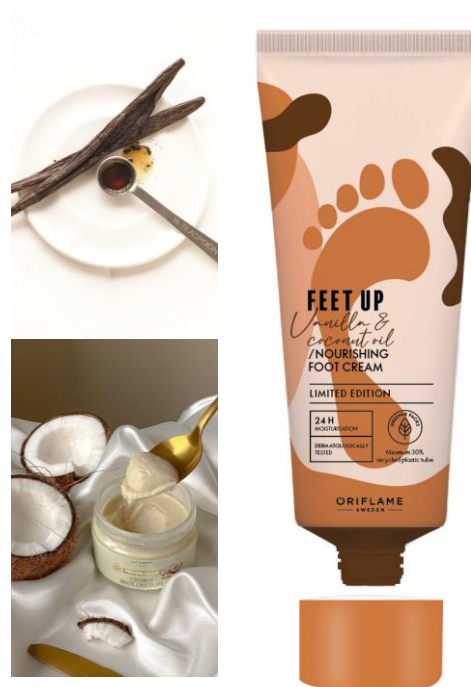
Coconut Oil & Vanilla Cream Winter 2026 FAD: 1 September, 2026