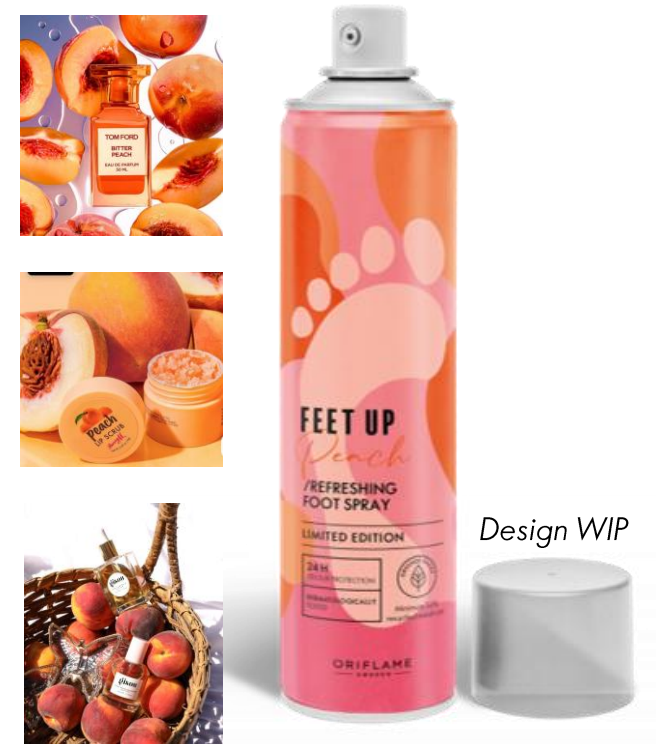
Peach Spray Summer 2027 FAD: 1 March, 2027