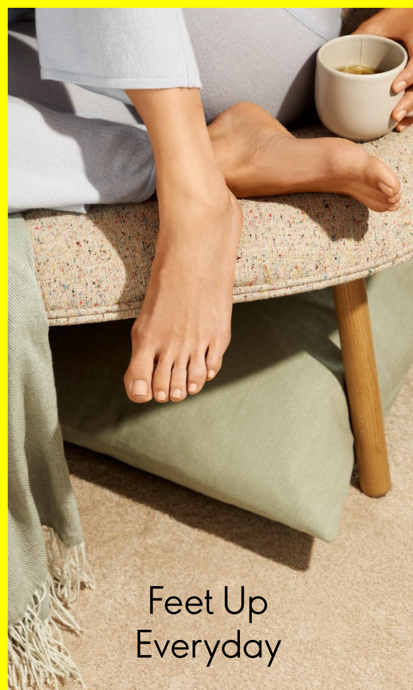
Feet Up Everyday