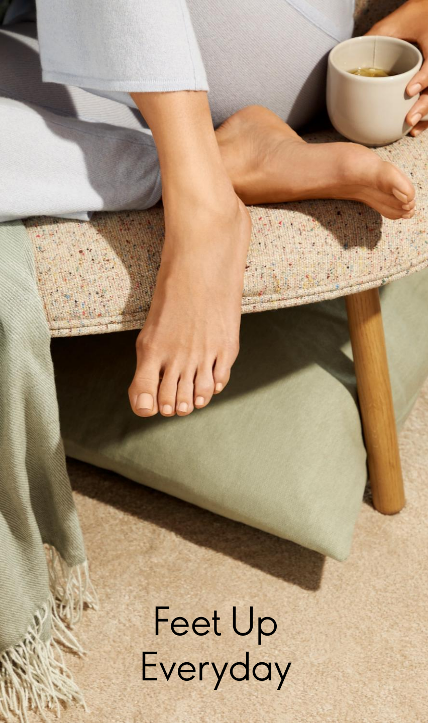
Feet Up Everyday