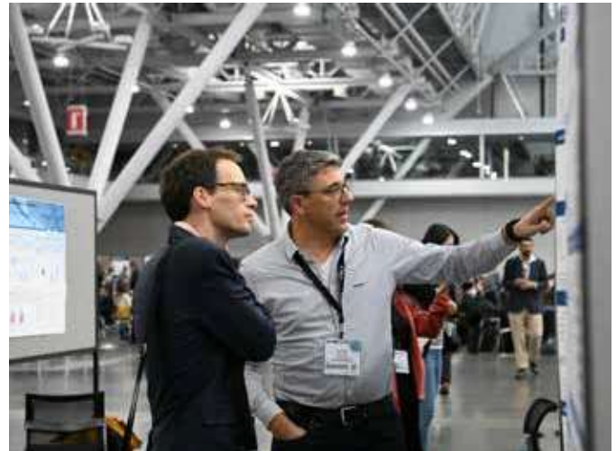
Exhibit Booth Staff: Allows access to exhibit hall during the Annual Meeting, Nov. 3-5, 2023. Booth staff are able to enter the exhibit hall during all open hours, as well as during designated move-in and move-out times.

Exhibit Hall Guest: Allows access to evening receptions during the Annual Meeting, Nov. 3-5, 2023, but does not permit attendance to scientific sessions.