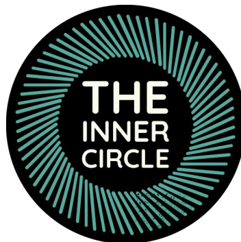
Inner Circle meeting for Headteachers