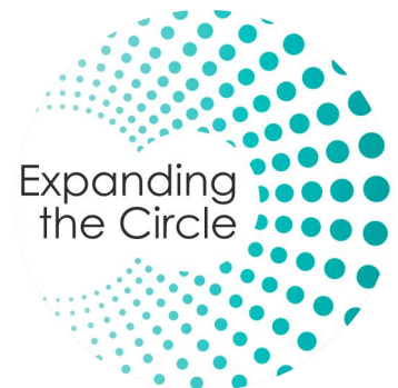
The Expanding Circle meetings for interested and new joined schools