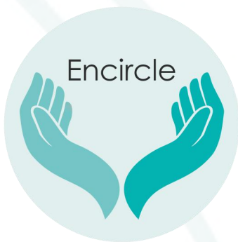
Encircle meeting for SENCOs