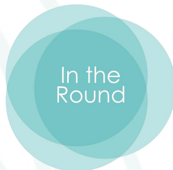
In the round meetings for Primary Phase