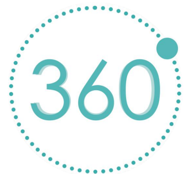
360 meeting for staff working for the Trust