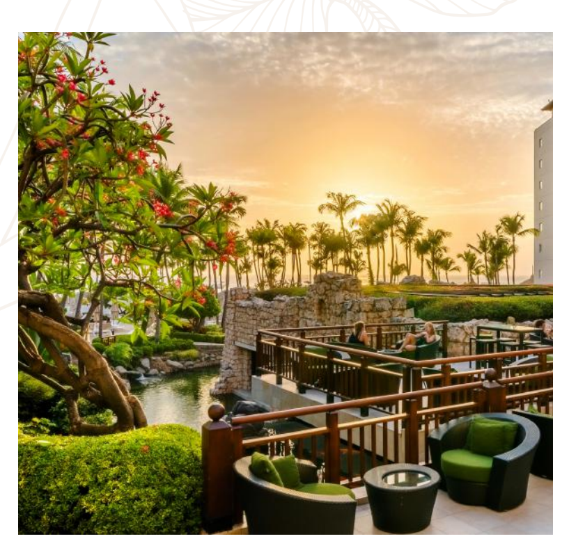
ALFRESCO LOBBY BAR IS A GREAT LOCATION TO GATHER FOR A CASUAL MEET & GREET

Pursuant to a civil marriage, an officiant for a religious or non-denominational ceremony may be arranged through the resort, or by the couple. For more information, please visit the official tourism website.