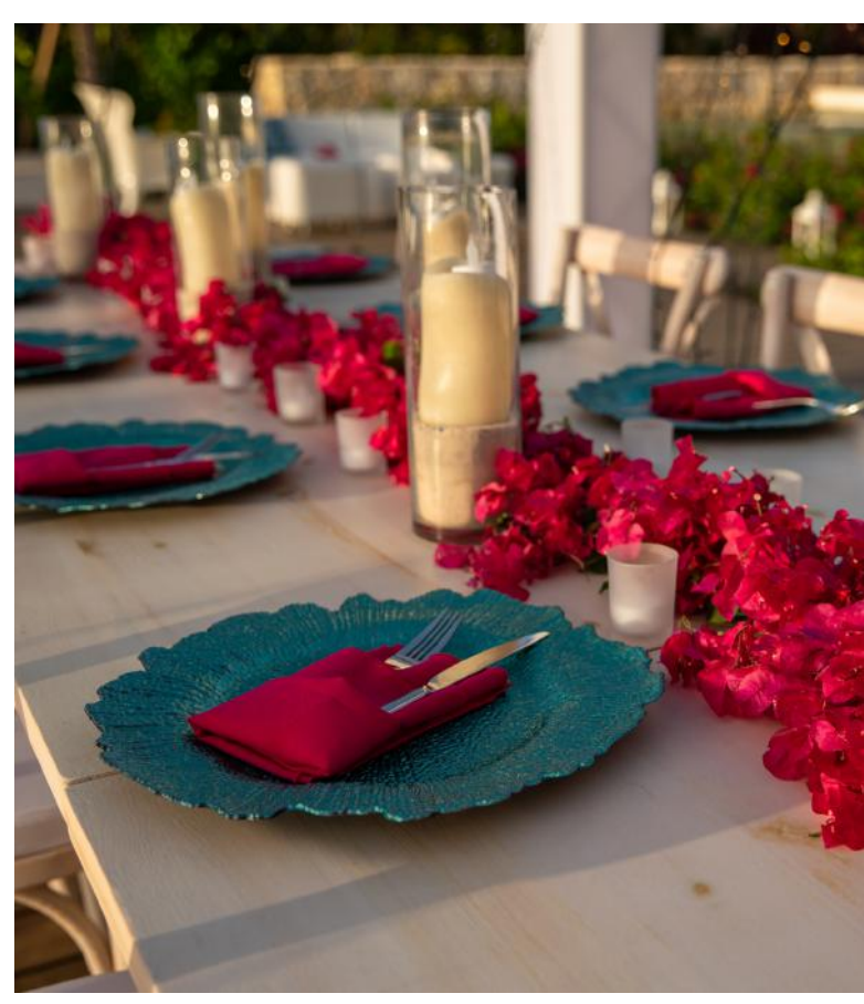
TO ENSURE YOU GET WHAT YOU WANT, YOUR ROMANCE PLANNER WILL CONNECT YOU WITH YOUR FLORIST

This number will be considered a guarantee, not subject to reduction. Charges will be made accordingly.