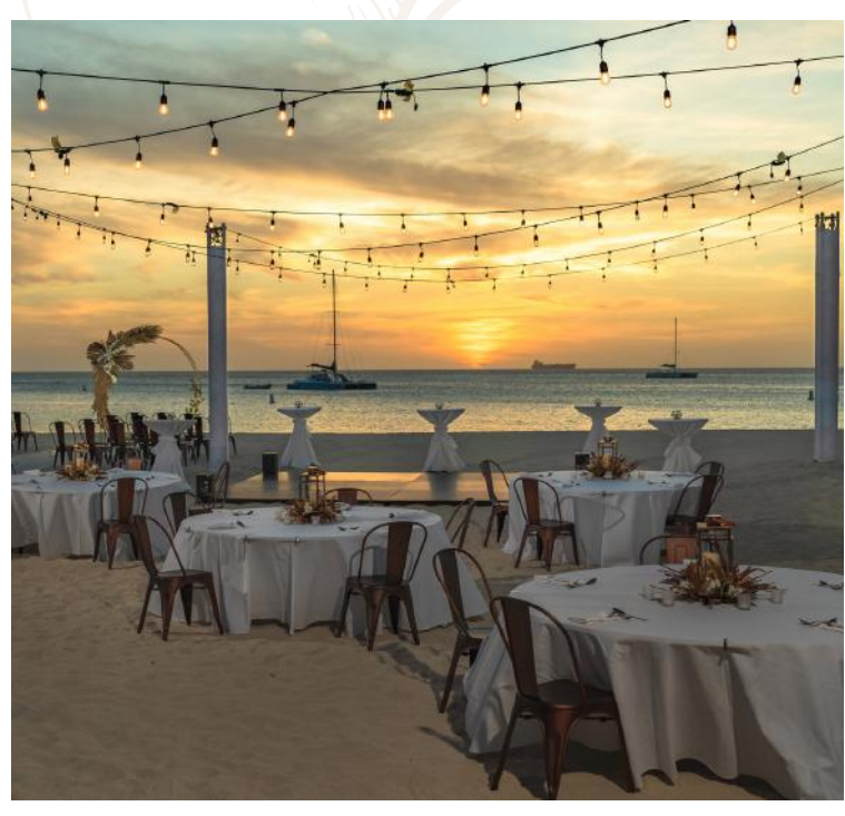
EASILY TRANSITION FROM WEDDING TO RECEPTION ALL IN ONE MAGNIFICENT LOCATION

In summer, the sun sets approximately 6:45 to 7:10 p.m. and 6:15 to 6:30 p.m. in the winter. For the best photos, we recommend starting your sunset ceremony 30 minutes early.