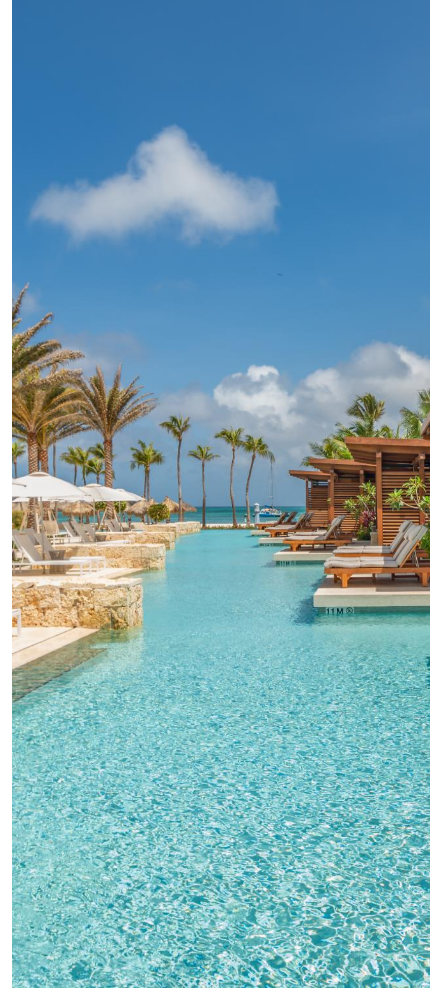
TRANKILO, OUR NEW ADULTS-ONLY POOL IS A GREAT PLACE TO RELAX AND ENJOY A CABANA

Aerial yoga, mixology classes, meditation, tennis clinics and more are all complementary and available by reservation to guests at Hyatt Regency Aruba Resort Spa and Casino. To learn more about these complementary services or to reserve a pool umbrella or beach palapa prior to arrival, please visit our online site: Hyatt Beach Services.