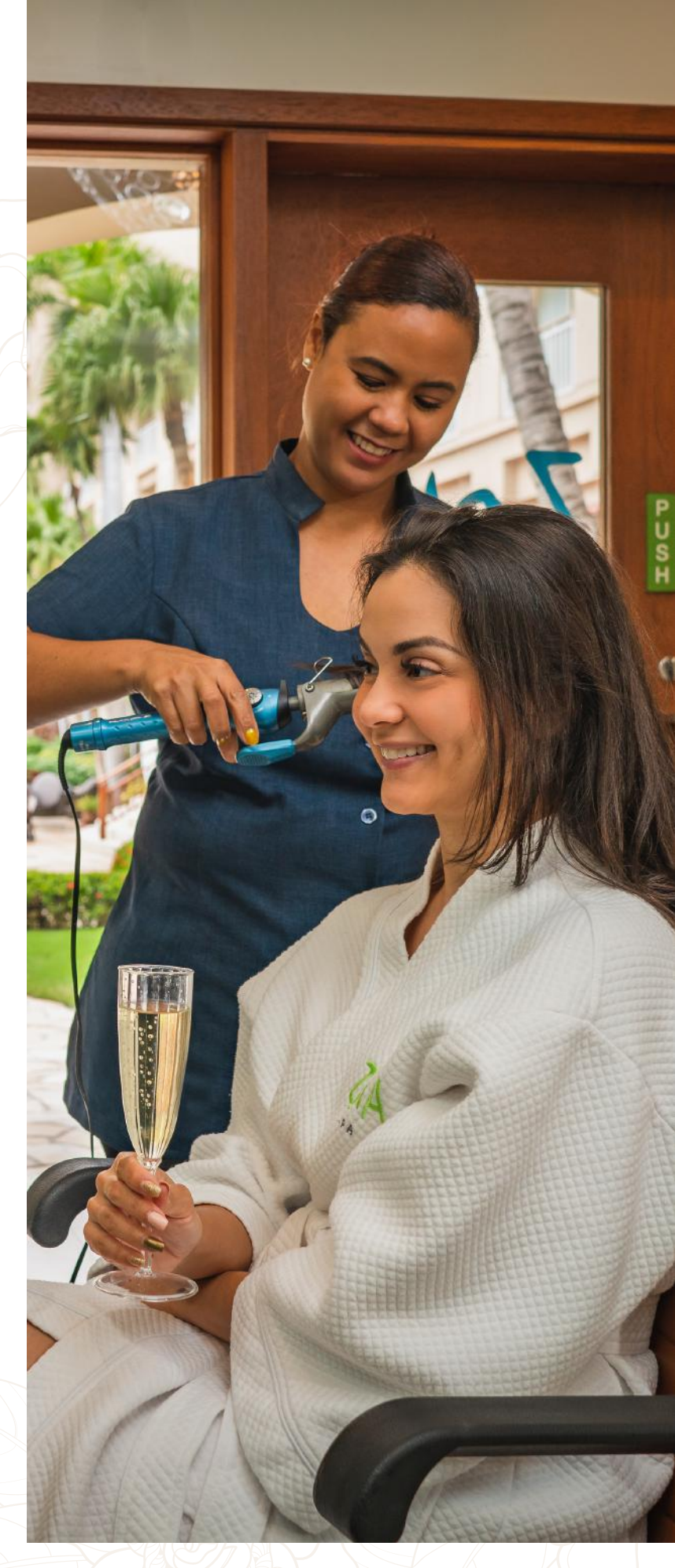
ZOIA SPA AND SALON OFFERS HAIR, MAKEUP, AND NAIL SERVICES FOR YOUR BIG DAY'

ZoiA Spa is the only certified HydraFacial® spa on the island. For you, or your guests who want a burst of hydration, this is a preferred facial for many of our wedding parties. Please visit ZoiA Spa to learn more or to make an appointment.