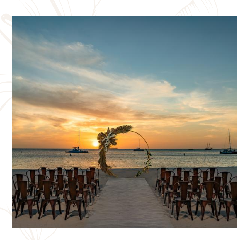
THE BEACH IS EASILY OUR MOST POPULAR VENUE

Please visit World of Hyatt to learn more about the program benefits.