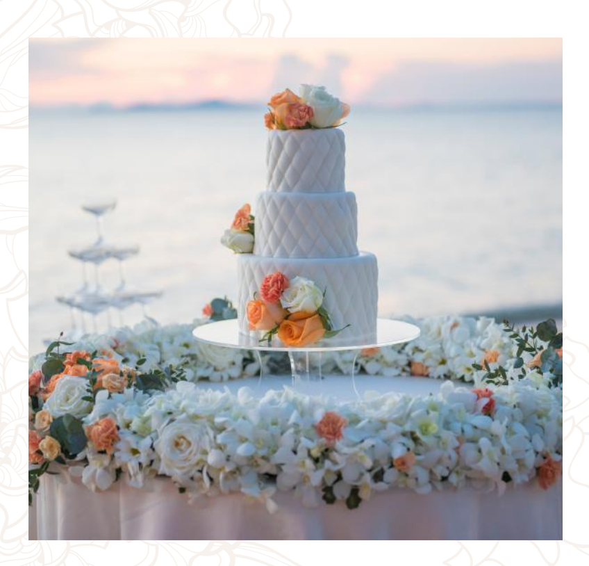
ASK TO SPEAK WITH OUR PASTRY CHEF ABOUT CAKE DESIGN AND OPTIONS

Your Wedding Specialist is your resort point of contact and will share with you a detailed schedule for your wedding day. The Wedding Specialist is also responsible for managing room blocks, connecting you with key vendors, and regularly meeting with you to review and plan each stage of the wedding process.