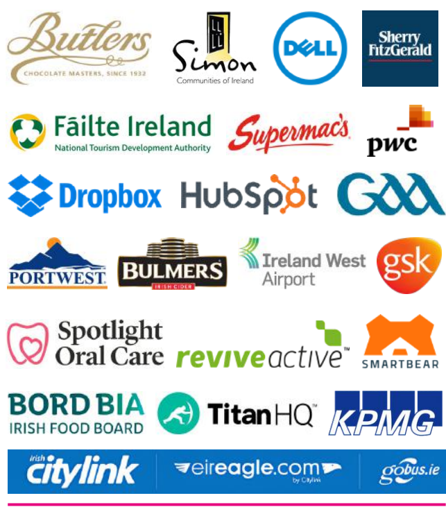
Examples of MSc Marketing Practice Host Company Opportunities

This is made possible by the broad range of companies that eagerly participate in our programme each year, ranging from burgeoning tech startups to established multinational giants, spanning every conceivable sector and situated across the country. These companies collaborate with us to craft challenging job specifications tailored specifically for students enrolled in our programme. This ensures that our students are tasked with meaningful responsibilities that align with the demands of modern marketing.