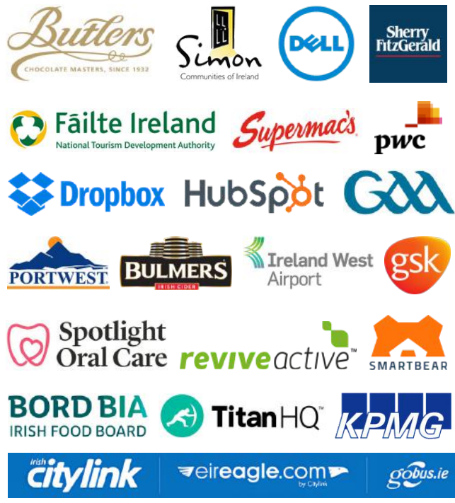
Examples of MSc Marketing Practice Host Company Opportunities

This is made possible by the broad range of companies that eagerly participate in our programme each year, ranging from burgeoning tech startups to established multinational giants, spanning every conceivable sector and situated across the country. These companies collaborate with us to craft challenging job specifications tailored specifically for students enrolled in our programme. This ensures that our students are tasked with meaningful responsibilities that align with the demands of modern marketing.