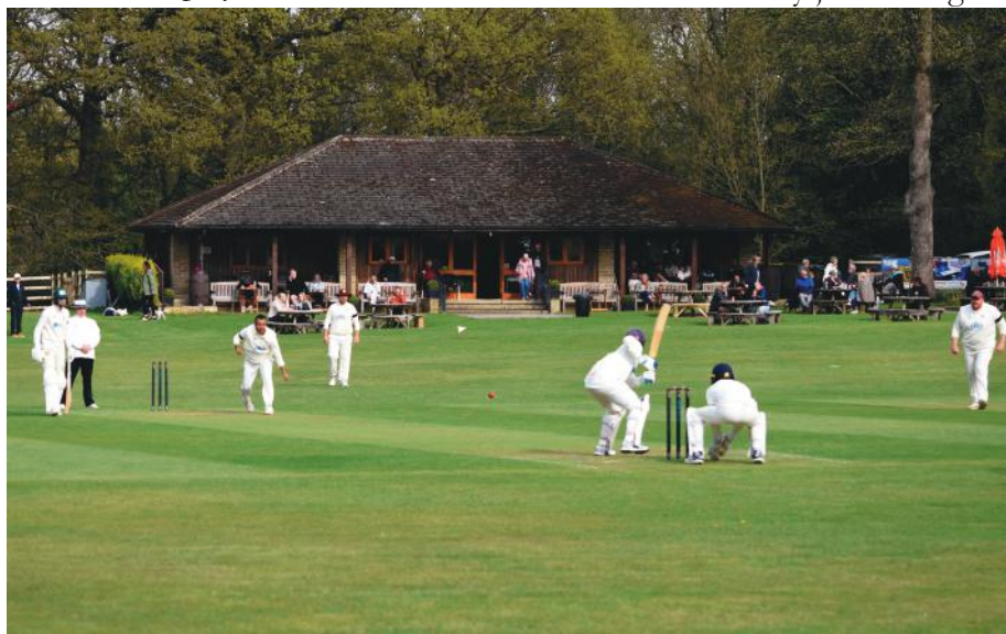
Action from Barnsley Woolley Miners v Shiregreen

The game of the day in the Championship Division saw Ackworth beat Wath by just as single