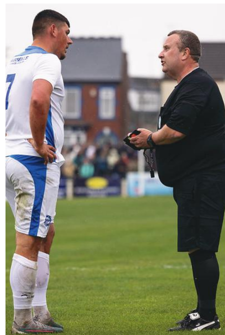
Westville (yellow) v AFP Pewter Pot (white)