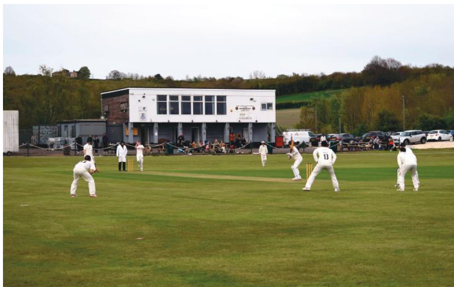
Premier Division action from Cawthorne v Doncaster Town