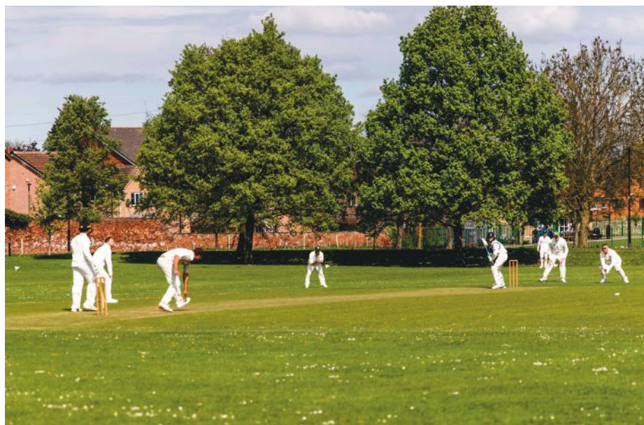
Division 7 - Adwick-le-Street v Barnsley Woolley 4th.