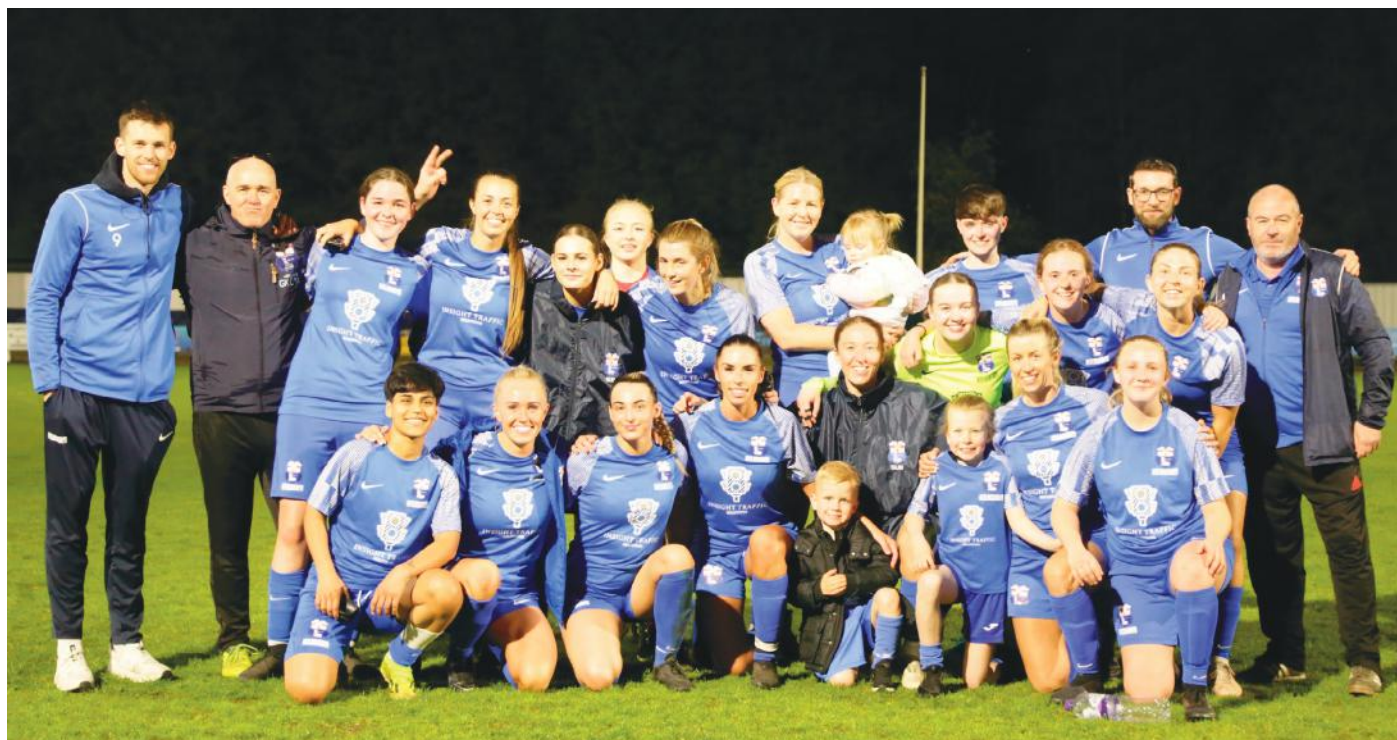
Rossington Main - Sheffield & Hallamshire Women's & Girls League Division One Champions