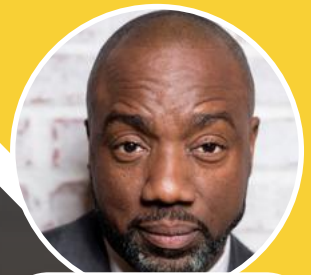
Dr. Malik Yoba Actor/Real Estate Developer YOBA Development