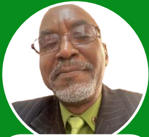
Raymon Cummings Registrar General, GRO