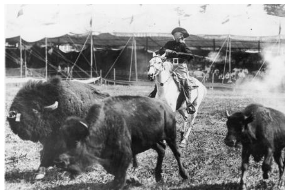
Buffalo Bill and Bison , BBCW, P.69.1002