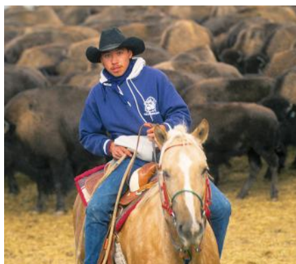
Indian Cowboy at Buffalo Roundup near Fort Smith, MT, 1999.